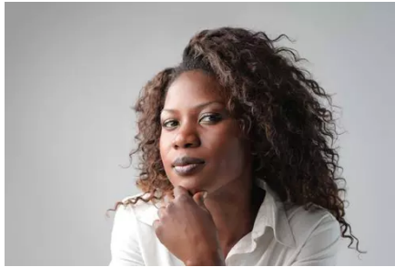
Online Degrees In Eswatini - The Cost May Surprise You