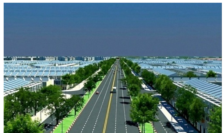
Graphic image of the Becamex residential-industrial project in Binh Phuoc province.

The project, covering 4,700ha in Chon Thanh District, has a total investment capital of VND20 trillion (US$888 million).