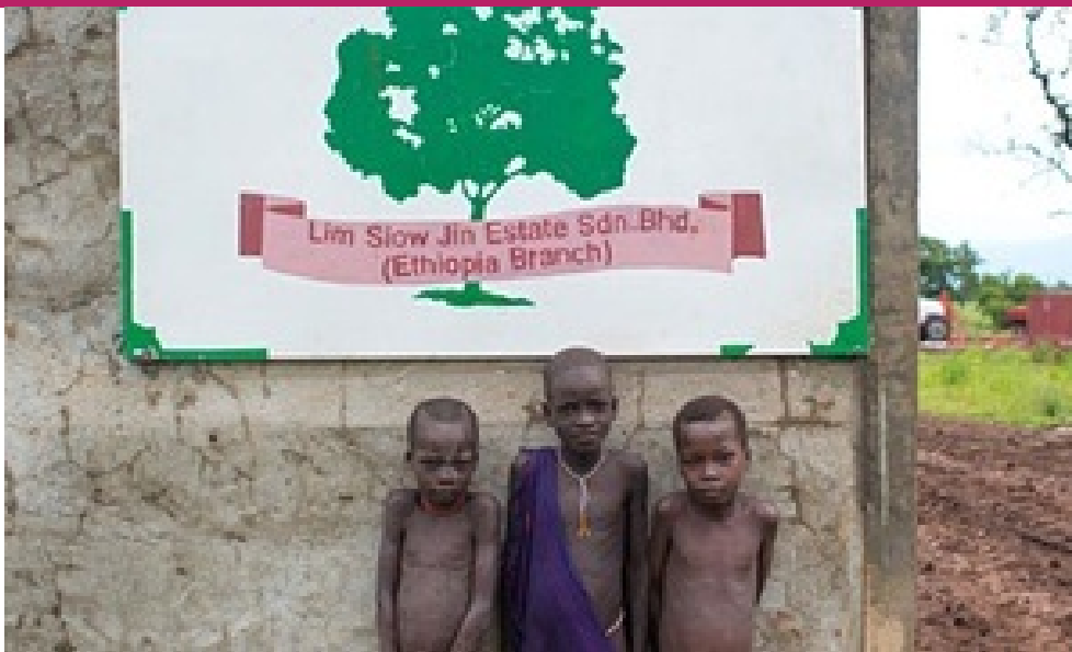
Suri boys at the entrance of the Koka Malaysian plantation, Omo valley, which is run by Lim Siow Jin estate.

Pastoralists living in the Omo valley are being forcibly relocated, imprisoned and killed due to plans to build a massive dam that will turn the region into a major centre for commercial farming