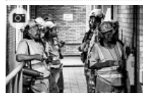
End of the mine