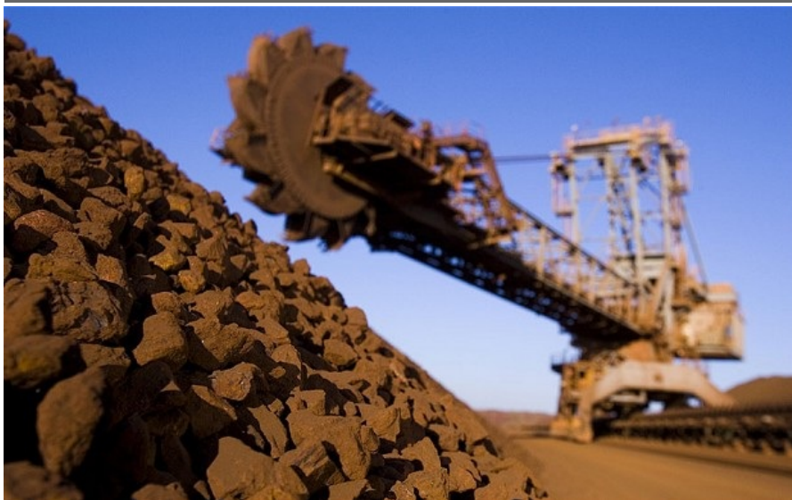
The protesters also demand Rio Tinto employ more locals