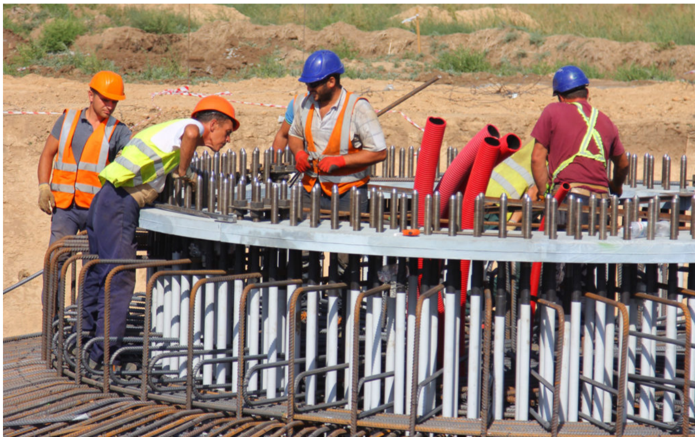
Workers constructing the base of a Syvash wind turbine.