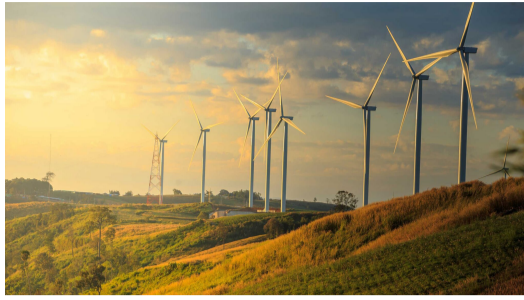
Serbia Wind Farm