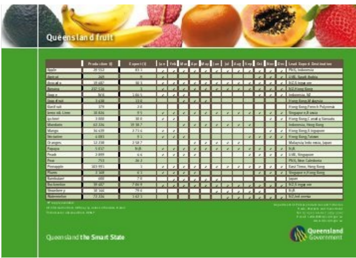
( https://www.yumpu.com/en/document/view/27308217/queensland-horticultural-production-and-export-chart )