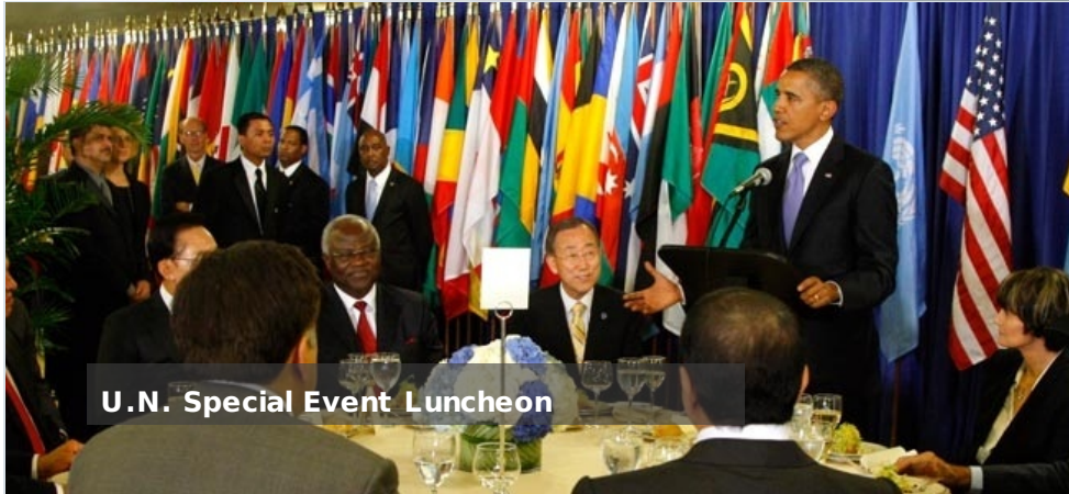
U.N. Special Event Luncheon