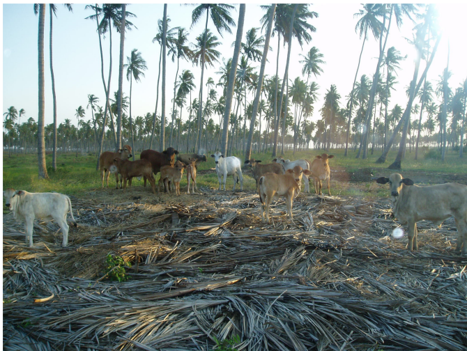
Fig. A10.3: Animal grazing in coconut plantation report to UNCTAD

At present crops are rainfed with minimal inputs in terms of fertilizers and agrochemicals. Climate data is given in a separate spreadsheet. During the course of devising a business plan there would be little trouble in getting finance for required inputs should these be necessary. MADAL have started excluding animals from various sectors of their coconut plantations. To date this amounts to 50 hectares where they have been planting pineapples Fig. A10.4 below. For a number of reasons MADAL management have asked that the pineapple planting project be kept confidential outside of Technoserve, Geest and M&S. For this reason the details of how they are complying and proving that they comply with the M&S food safety CoP's will not be included in a final