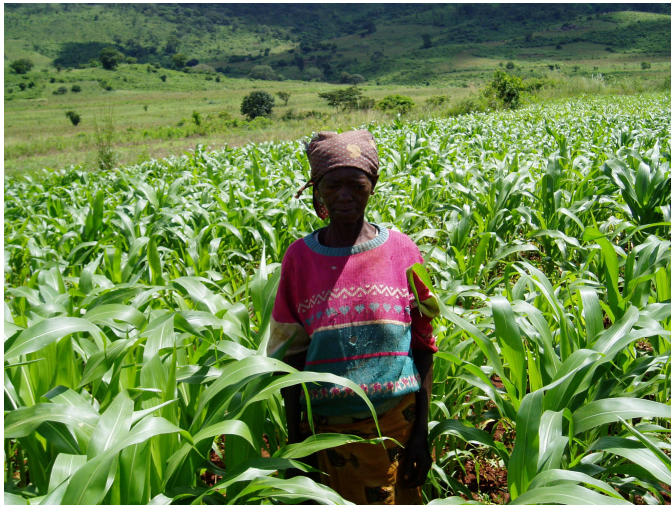
Fig. A10.9. Family sector farmer with babycorn crop

Total area grown by all 10 Associations of Family sector farmers amounts to 5 hectares. Each grower seems to have about 0.2 ha. From what we were able to see this is the most that can be grown by any family at any one time. The effort expended by Vanduzi to service and maintain their Family Sector farmers seemed completely out of proportion to the output. However Anthonie did tell us that they were trying to expand this area of production to about 40 hectares – out of a total planned production area of 80 hectares.