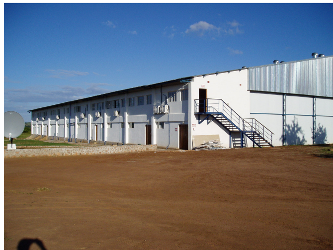
Fig. A10.8. Vanduzi pack house, Manica Province

The assessment regarding Vanduzi is that there has been a relatively poor performance in the recent past as to pack house throughput. The pack house is severely underutilized and there are plentiful signs of significantly high overheads in the form of capital stock and administrative staff. Our impression was that there had been a sweeping change in top management with a view to aggressively developing high volume throughput in the pack house (Fig A10.8).