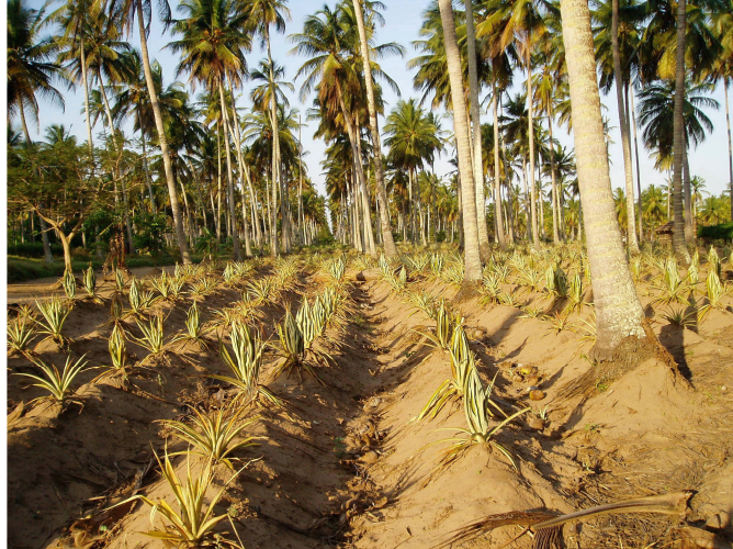
Fig. A10.2 Smallholder coconut and pineapple production near Quelimane

Madal are actively looking at bringing local family sector farmers as out growers, especially better quality growers such as in Fig A10.2. They already do this for coconuts for copra but there are few alternative crops outside of these. At this point there is no clear idea of how this would be organized and financed and Madal are looking for help. Finance would be from various aid agencies based on a suitable business plan.