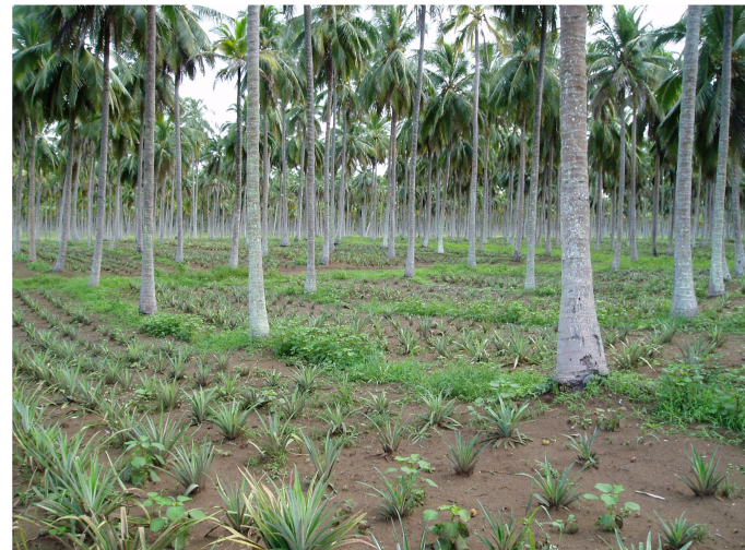
Fig. A10.4; Animal exclusion area in MADAL plantation