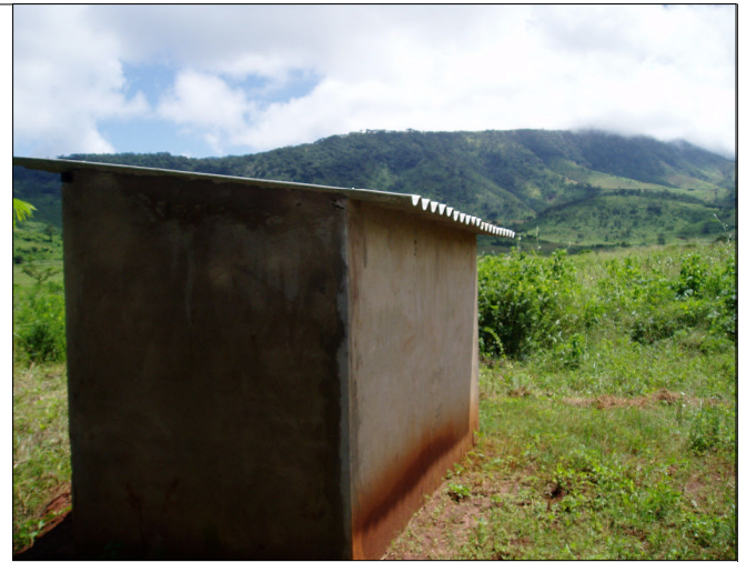
Fig A10.10: Toilet block at Family Sector Farm near Vanduzi

During the course of our visit to see Family sector farming we became aware of a number of difficulties. Crop management is difficult as usually only one person is involved. Where other demands are made on time crops suffer as in the case we saw weeds had largely got out of control and the crop yield potential was low. Irrigation is by hand made canals and is very labor intensive. Land preparation is expensive and difficult. Our overall impression was that the reward was disproportionately low compared to the effort and that Vanduzi were going to reposition themselves into focusing mainly on commercial production in the short term.