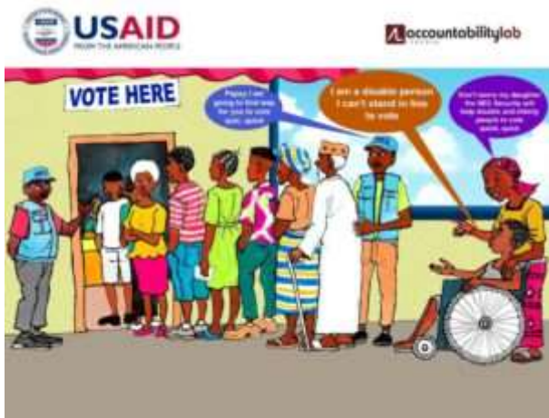
Cartoon illustrating voters in queue patiently waiting for their turn to vote