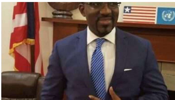
'Liberia at the Red Sea'