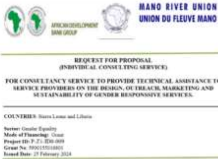
SPN_TA to support Design of Gender Responsive Product Services