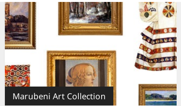
Marubeni Art Collection