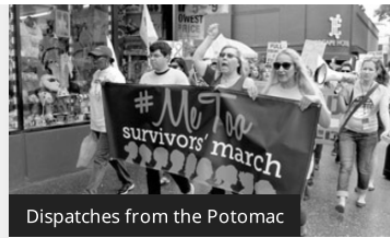
Dispatches from the Potomac