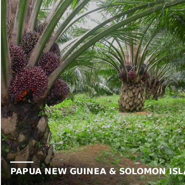
PAPUA NEW GUINEA & SOLOMON ISLANDS