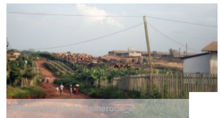
M'bang factory in Cameroon_2