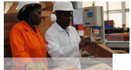
M'bang factory in Cameroon_1