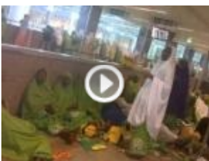
Female Muslim Pilgrims Without...