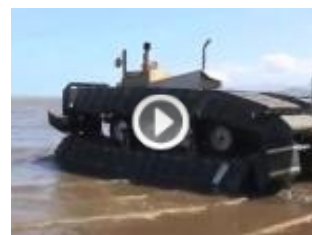
New Military Vehicle Rides on Water...