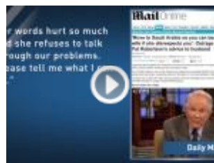
Pat Robertson Tells Man to Move to...