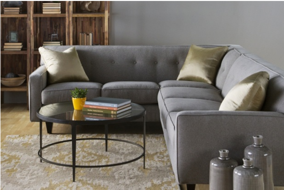
The Draper two-piece sectional

Perfect for those days when you've just thrown up at your friend's mother's funeral and you need a little "me" time to reflect on mortality and your ceaseless battle against human loneliness.