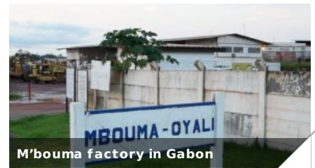
M'bouma factory in Gabon