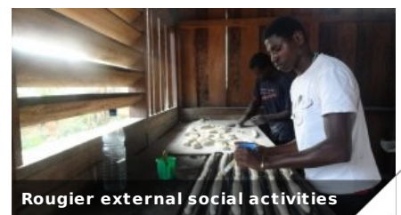
Rougier external social activities