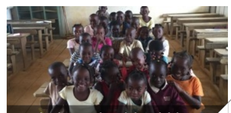
Rougier internal social activities