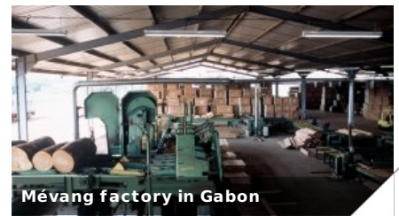
Mévang factory in Gabon