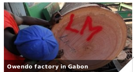
Owendo factory in Gabon