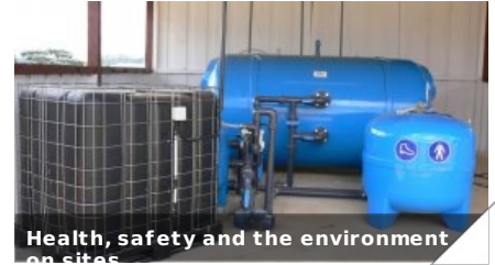
Health, safety and the environment on sites