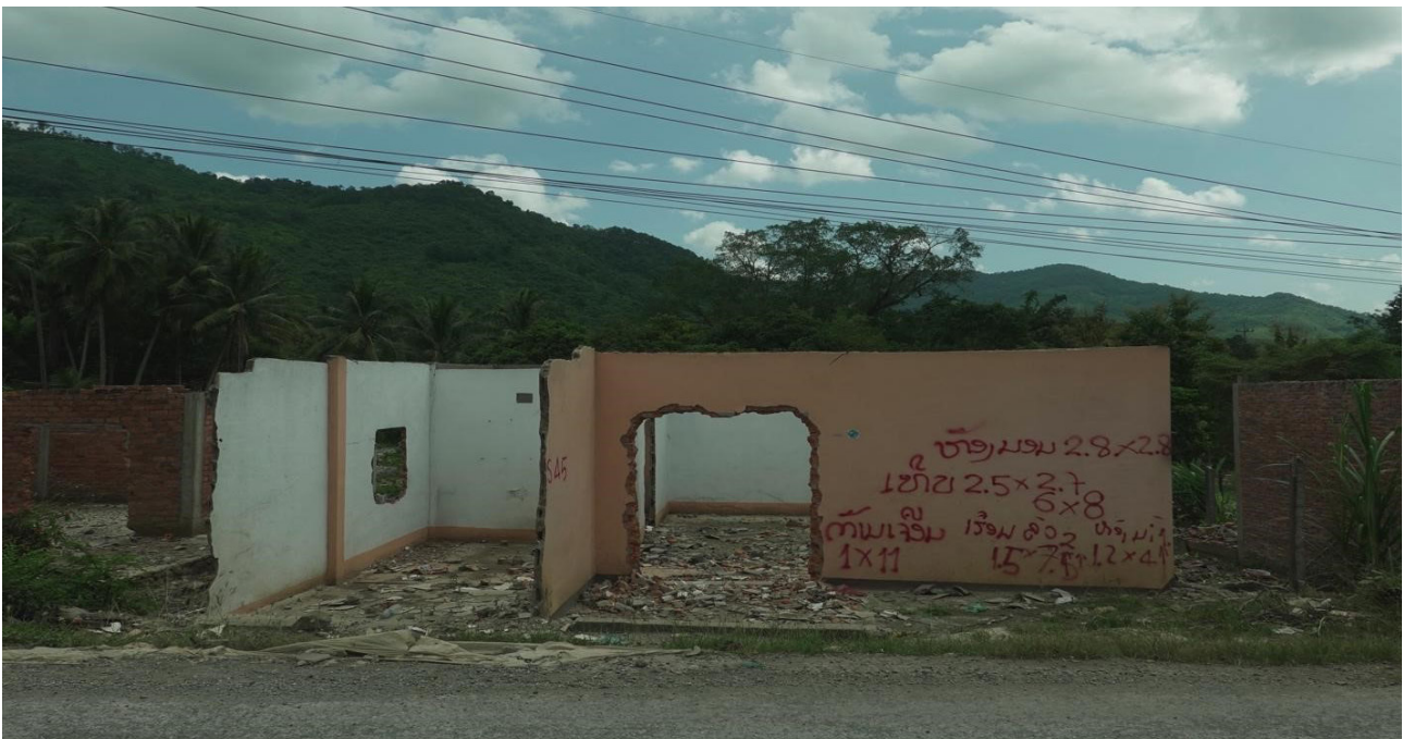
A home in old Lat Tha Hae village, demolished to make way for the Nam Ou 1 Dam

A man walking by overheard our conversation and shouted, “You know they will compensate you for everything. You don’t need to complain to outsiders about this!” He pulled out a smart-