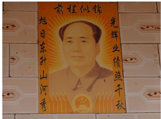
Long Tang village, Yoth Ou District, Phongsaly province, October 2018.

Arriving in the northern province of Phongsaly province by truck, I was surprised that this remote corner of the land of a million elephants felt like a new province of China. Chinese luxury cars sped along the bumpy road, posing a danger to the children playing along the dusty roadside. In nearly every village I passed, the newer concrete homes featured tiles bearing Mao Zedong's image. "I've seen this image in many homes in this area. May I ask who he is?" I asked the village leader at a local truck stop.