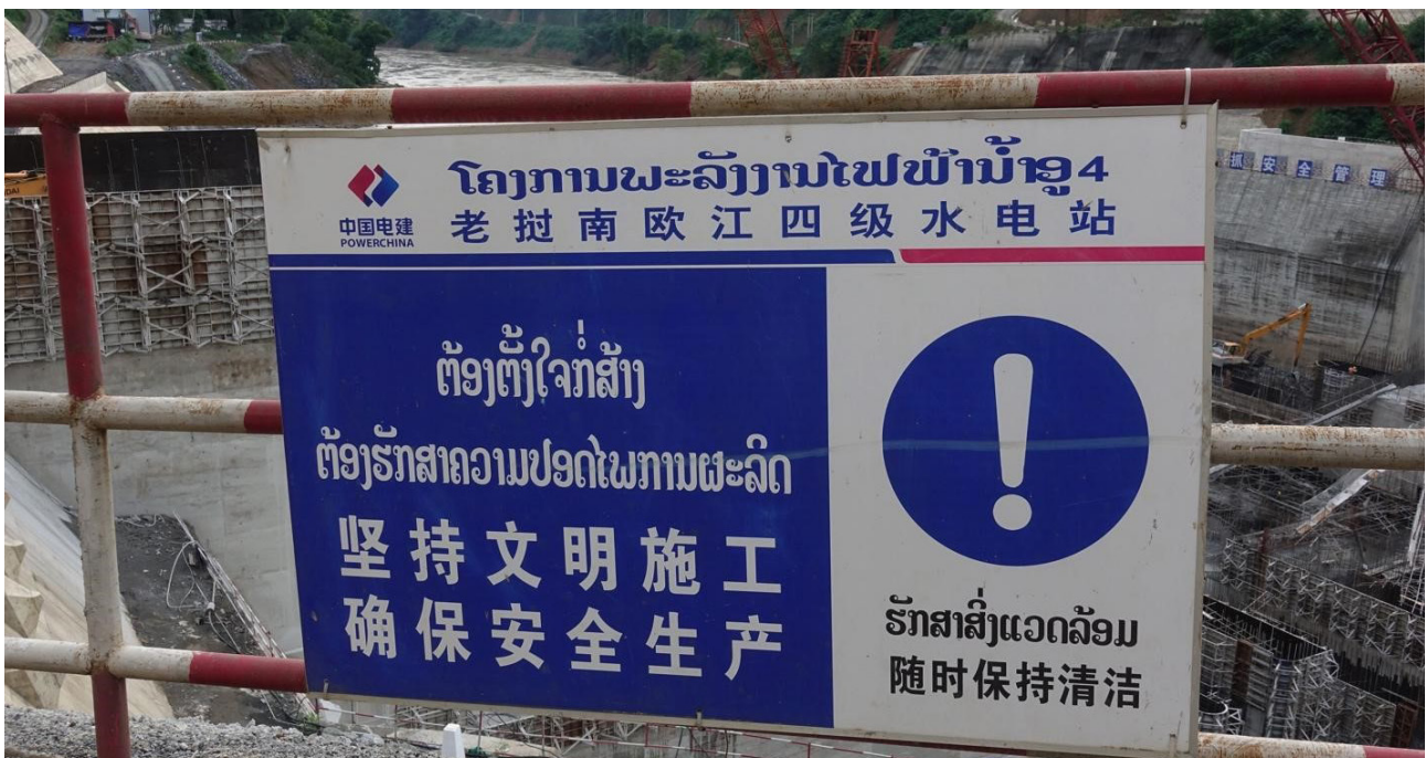
The Nam Ou 4 dam, currently under construction. Khua district, Phongsaly province. Oct 2018