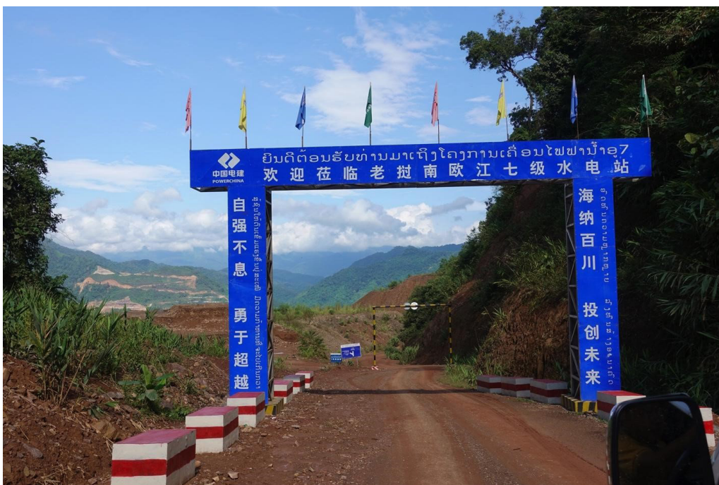
Entrance to the Nam Ou 7 Dam, Muang Hath Hin village, Phongsaly district, Phongsaly province. Oct 2018

On the way back to Phongsali town, I stopped in Muang Hath Hin village, just below the Nam Ou 7 dam. Father Xieng, an ethnic Lue elder, led me up a steep path to an ancient temple of mysterious origin that had been in existence before the area was settled. As we sat overlooking the village, he told me, "We are afraid of flooding from the Nam Ou 7, as our village is directly downstream of the dam. Since the project's completion, the flow of the river has become erratic. During the rainy season, the water level is very high. We requested two times to relocate our village to higher ground, but the government ignored our requests. We don't want to be like Hat Sa," Father Xieng referred to the next town downstream, severely damaged by floodwater in