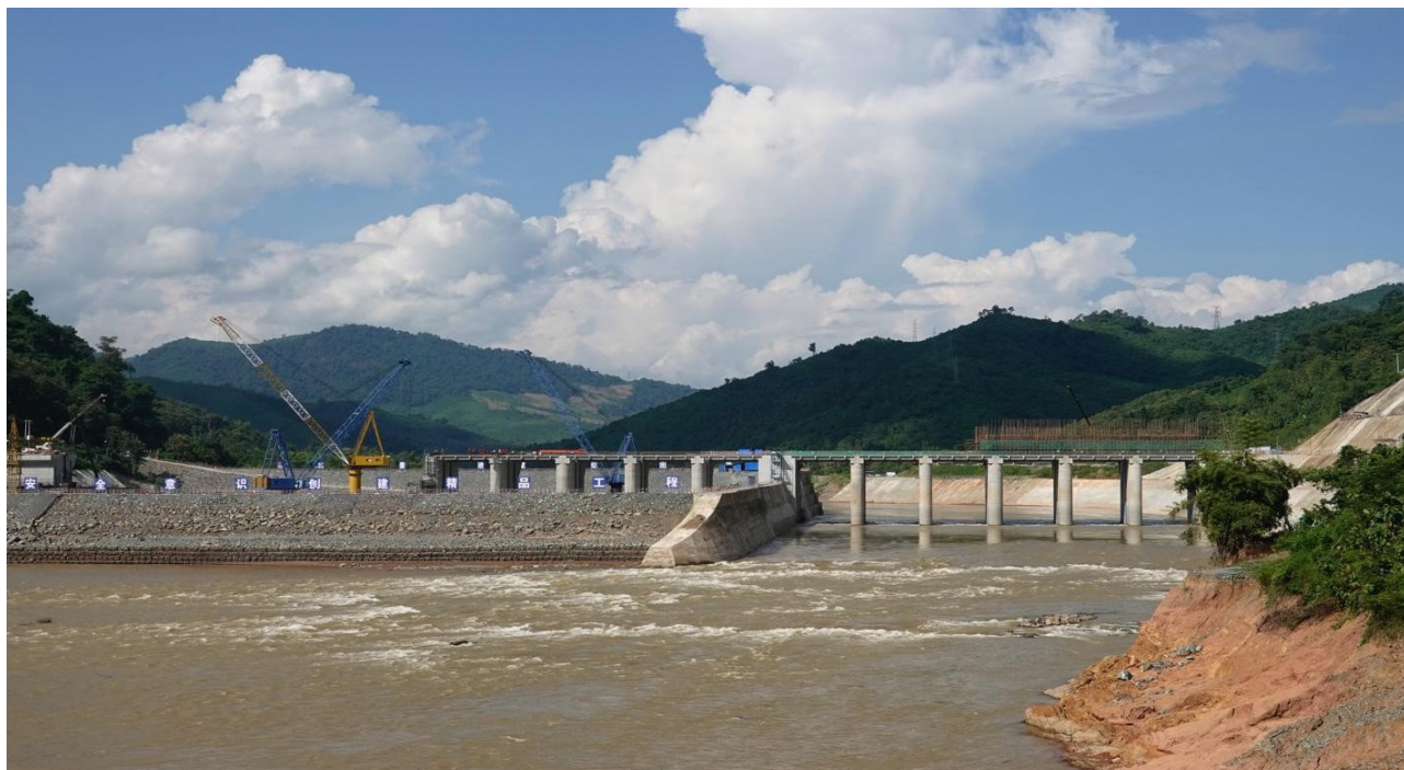
The Nam Ou 1 station in Luang Prabang Province, about 70% complete

Nam Ou 2 has a total installed capacity of 120 MW and generates about 546 GWh of electricity annually for local supply. On the way, we passed by resettlement villages with rows of new houses along the highway.