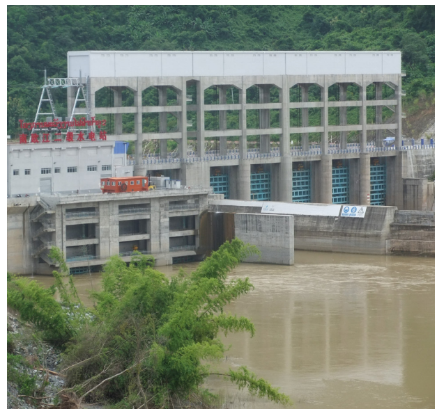
The Nam Ou 2 dam. Oct 2018

After spending the night in Ngoi town, I continued by boat to the tourist town of Nong Khiaw, and from there took a minivan to the Nam Ou 2 dam in Luang Prabang Province. Boat service between Nong Khiaw and Luang Prabang town was stopped due to construction of the Nam Ou 2 hydropower station, the first of the series of seven Ou River dams. Construction began in 2012 and commercial operation commenced in 2017. According to the Nam Ou Power Company Ltd.,