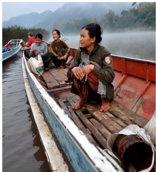
Khua district, Phongsaly province, October 2018. Few passenger boats remain on the Ou River

“There is no more community market here in Hat Sa because it was destroyed when they released water from the Nam Ou 6 dam in July of 2018,” explained Noy’s father. “The community market used to be held every 10 days. Now we have to travel one hour by motorbike to buy food from the market in Phongsali town, and the cost of petrol cuts into our food budget.”