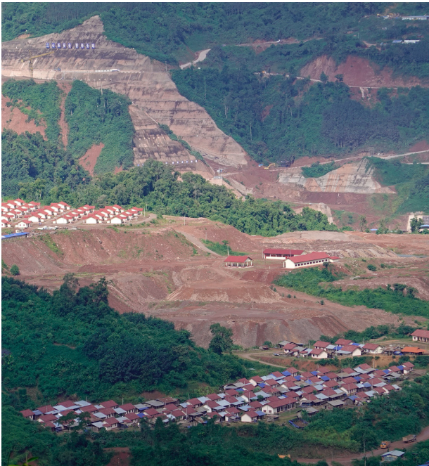
Muang Tha Hin resettlement village