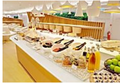
Ein brandneues Loungekonzept am SkyTeam