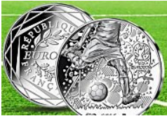
Jetzt die erste offizielle Münze zur EM 2016 MDM