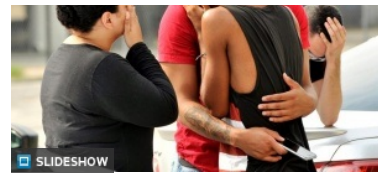
The worst mass shootings in the U.S. SLIDESHOW