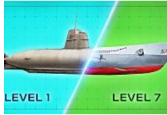
Are you a strategic thinker? Test your skills Soldiers: Free Online Game