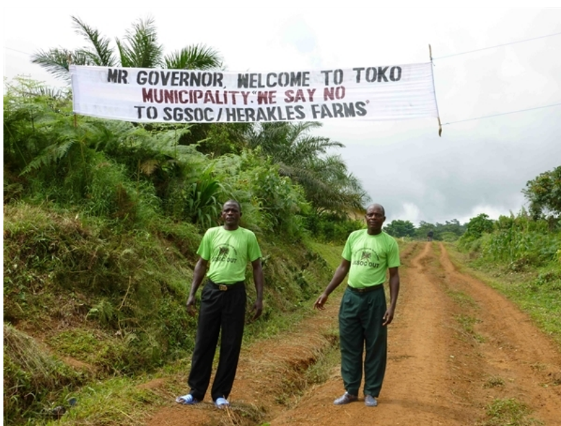
Resistance to a landgrab for a new oil palm plantation in Cameroon.

The communities facing land grabs from palm oil companies are under tremendous pressure to accommodate them, with pressure coming from the companies, the government, the local chiefs and even the army and paramilitaries. Those who resist face arrest, harassment and violence. And yet communities in Africa and around the world, from Papua New