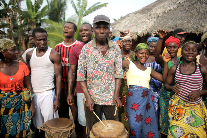
The Jobbahn Clan convinced Liberia's government to stop the expansion of plantations onto their lands.

Strong community resistance combined with national and international, well targeted pressure, can roll back land grabs. The Jobbahn Clan in Liberia provides an inspiring example. When the British company Equatorial Palm Oil began surveying their lands as part of a deal it signed with the Liberian government, the communities took action to stop the work crews. They then marched to the local government offices to make it clear that they had never been consulted about the deal and that they would never give up their lands for the project. Along the way they were beaten, arrested and thrown in jail. But the communities refused to back down. Local and international NGOs joined their struggle, and exposed what was happening to the world. Finally, in March 2014, community leaders met with the Liberian President, Ellen Johnson Sirleaf, and secured a commitment from her to stop the company from expanding on their lands. Now Liberian groups are hoping to replicate these efforts with other affected communities in the country. 2