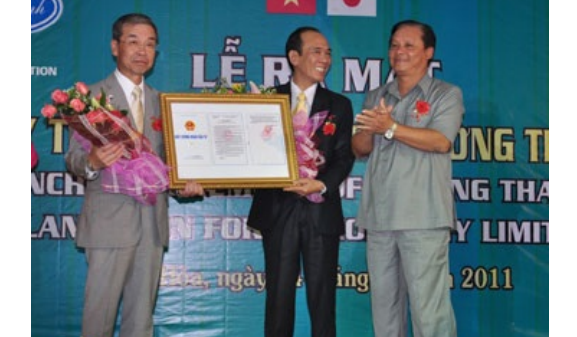
Chairman of the Provincial People's Committee hands over the Investment Certificate to leader of OJI Forest Planting Company Ltd.

Numerous prospects of growing medicinal plants