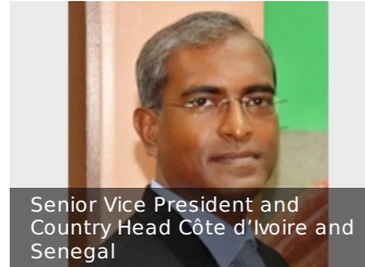
Senior Vice President and Country Head Côte d'Ivoire and Senegal