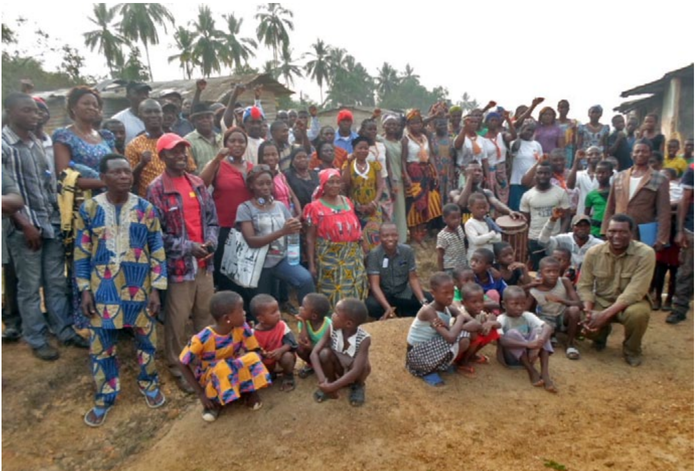
Gathering of leaders from African communities affected by oil palm plantations, Ndian, Cameroon, 2016