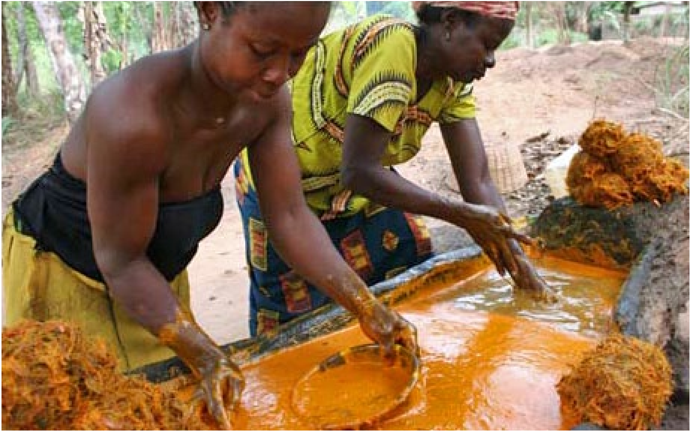
Nigerian women processing palm oil using traditional methods.

that such schemes are a way for villagers to 'get rich quickly'. These programmes are sometimes written into the concession agreements with the government and companies often receive funding from African governments, UN institutions, donors or development banks for these outgrower or smallholder programmes. In several cases, the schemes are carried out with the collaboration of NGOs. Some outgrower schemes have existed for decades, and were established through the World Bank funded industrial oil palm programmes of the 1970s and 1980s. This is the case in Ghana, where the area under outgrower schemes is larger than the area under industrial plantations. 15 In most recent cases, however, these outgrower schemes are not the priority for the companies, and the companies channel far more of their resources into their own company plantations, for which they can maintain stricter control over production.