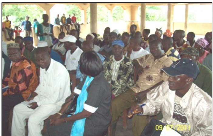
Representatives of the host communities

Further, he advised all his subjects and colleague chiefs not to politicize the development as he puts it will hinder the success of the project.