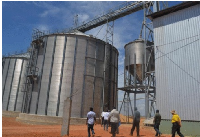
A large rice mill has been installed and is operational. (Internet Image)