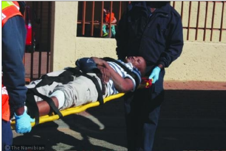
CAUGHT IN THE ACT... A robbery suspect was caught red-handed at a house in Cimbebasia yesterday. In an attempt to flee, he allegedly hit one of the police officers with an iron bar to which the police's reaction resulted in a gun wound on his knee.