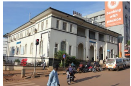
Although Kampala now boasts of many big and good looking buildings, there are some that have...