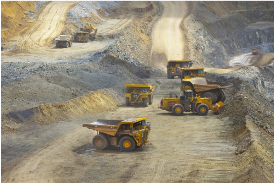
Acacia Mining’s Buzwagi mine in Tanzania.

Acacia Mining Plc (LON:ACA), spun off from Barrick Gold (TSX, NYSE:ABX) in 2010, will soon hear whether it will have to pay a former partner in Tanzania about $115 million over the loss of a concession in the African country.