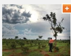
Bulyanhulu mine is south of Lake Victoria in the district of Kahama, Shinyanga region.

The Bulyanhulu mine lies in the shear hosted quartz-veined deposit, which comprises of Archaean rock formations. It hosts mafic volcanic flows overlaid by a series of pyroclastics and ash tuffs. Argillite is hosted between the mafic and felsic rocks present at the mine.