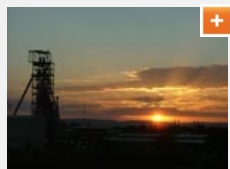
The processing plant can operate at a rated capacity of 3,300t of ore a day.