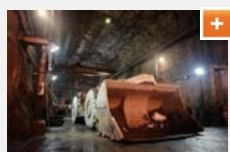
Bulyanhulu mine produced 262,034oz of gold in 2011.