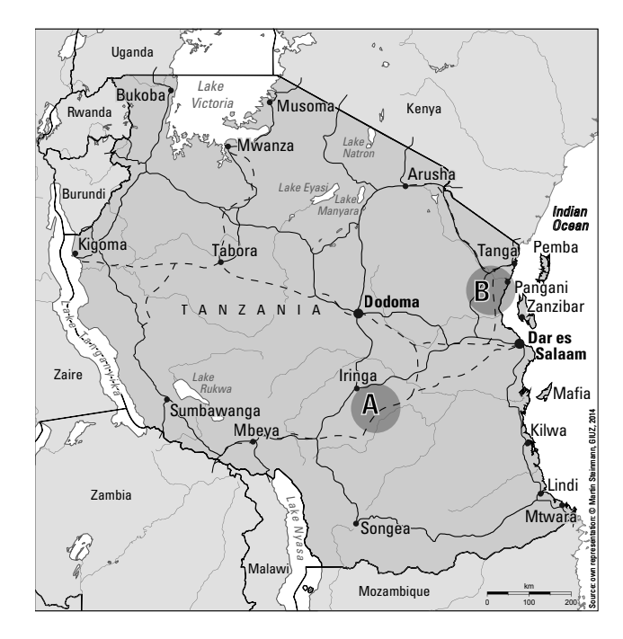
Figure 1 . Map of Tanzania displaying the case study areas. A: New Forests Company (NFC) in Kilolo district, B: Tanga Forests Ltd (TF) in Pangani district.

The current procedure for land acquisition is lengthy and onerous. Foreign investors cannot lease village land directly. Land deals are only possible if the land is transferred to the category general land , which is under the jurisdiction of the Ministry of Lands and Human Settlements Development (in short: Ministry of Lands). This process requires the village assembly's agreement<sup>2</sup>, documented by meeting minutes. Further, the involved parties have to agree on the compensation. Compensation should be based on market value, estimated by a government expert, and should be paid for land and unexhausted improvements , such as crops or trees. Finally, after several steps, the Ministry of Lands on behalf of the President enacts the land transfer.