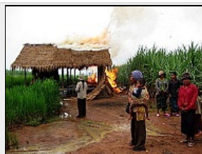
Enlarge this picture