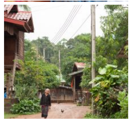
Improving community access to r and electricity .