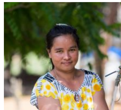
Improving access to clean water

LXML employs approximately 3,000 people in Lao PDR. These jobs have injected wemineforprogress.com/communities/laos/