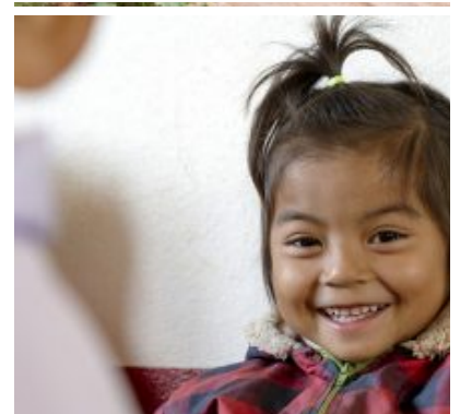
Healthier and happier children