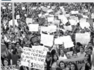
World Press Freedom Day 2018