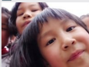
World Autism Awareness Day 2018