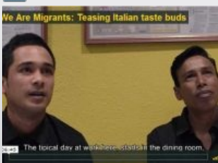
We Are Migrants: Teasing Italian Taste Buds