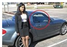
OMG. Best College in the World! Universities.AC