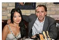
10 Celebs Who Married Ordinary People Or Fans