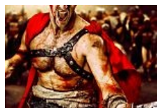
Sparta : The Strategy Game Phenomenon of 2015 Sparta Online Game