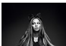
The 10 Richest Recording Artists The 405