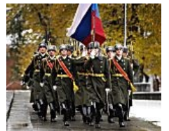
The Top 10 Elite Fighting Units In The World Shockpedia