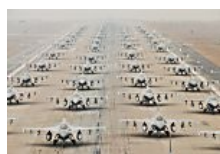
Top 30 Most Powerful Armies In The World Right Shockpedia