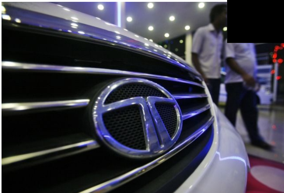
Men walk inside a Tata Motors showroom on the outskirts of Agartala, Tripura, in November 2012