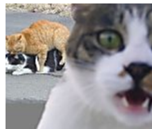
These Are The Funniest Cat Photobombs You Viral Heroes