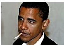
15 People Who Hide Their Smoking Habit Healthnutz