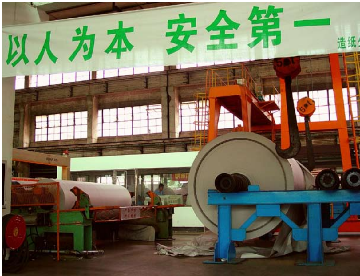
Figure 8. Paper factory in Guangzhou, Guangdong

Although there has been active development of eucalypt plantations in southern China by companies planning integrated forest–pulp–paper industries, they face obstacles in their efforts to secure an adequate plantation land base and it is likely that they will remain largely reliant on imported wood chips beyond 2009 (Cossalter 2004). More extensive planting of cold-tolerant eucalypts in provinces such as Fujian, Hunan, northern Guangxi and, possibly, Jiangxi are likely to boost local supplies of wood fibre.