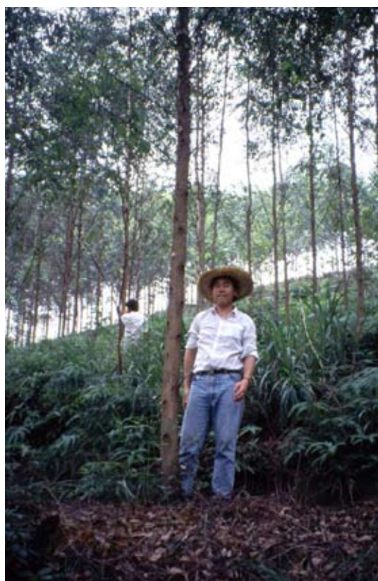
Figure 11. A fertiliser trial in a clonal planting of E. urophylla × E. grandis aged 25 months at Zhenghai State Forest Farm, Guangdong [J. Turnbull]

Research conducted in and after the ACIAR project has produced reliable data on the requirements of trees for the micronutrients B, copper (Cu), iron (Fe), manganese (Mn) and zinc (Zn) in the years immediately following planting, and corrective fertiliser schedules are now available for many soil types (Dell et al. 2003). A manual illustrating nutrient disorders in plantation eucalypts, much of it based on research in China, and prescriptions for foliar analysis, has been produced by Dell et al. (2001). Some companies planting eucalypts in southern China are routinely using foliar analysis to determine nutrients limiting tree growth.