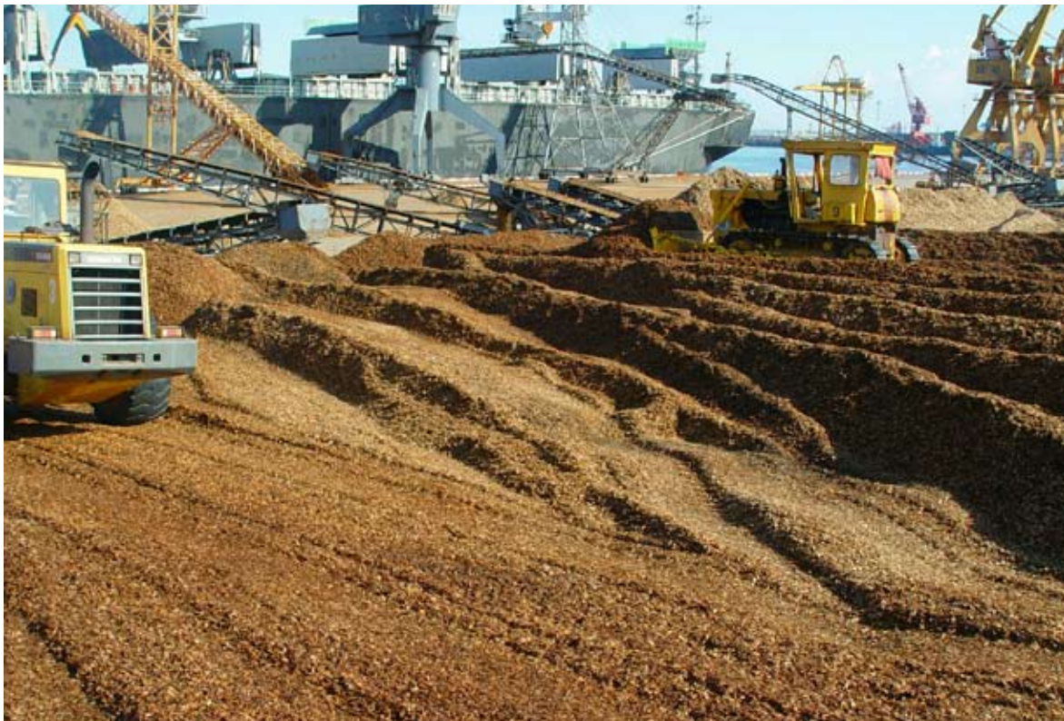
Figure 5. Eucalypt wood chips being exported from Zhanjiang, Guangdong

In western Guangdong, there are large eucalypt plantations on Leizhou Peninsula and adjacent areas in Zhanjiang and Maoming prefectures. It was in this area that the joint venture company Fuxing–UPM Kymmene began, in 2003, to investigate and prepare for wood supplies for a future bleached hardwood kraft pulp mill of 700,000 air-dried tonnes/year capacity (Cossalter 2004). From 2003 to 2007, it planned an overall program of 200,000 ha, of which 45% would be on land with collective and individual user rights, 25% on leased land and 30% under wood supply contracts. Although this region has almost sufficient wood resources to supply a mill of this size, a large part of the resource is committed to other users and much of the mill's wood needs will have to come from new plantations. Land availability is then a problem, as there is competition from several agricultural crops. In November 2004, after studies of local conditions and the availability and cost of wood for a modern large-scale pulp mill were concluded, UPM withdrew from the joint-venture company and the future of a pulp mill in the region is uncertain. In southern China, market prices for delivered pulpwood are well above