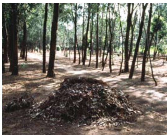
Figure 12. Litter raked for fuel in a Guangxi eucalypt plantation

In Guangxi, Stora Enso managers have indicated that, while the company wants to retain leaf and bark residues on site for soil protection, nutrient recycling and water conservation, they will permit collection of fallen woody branches and woody harvesting residues for fuelwood (UNDP 2006), and some plantation managers elsewhere also tolerate fuelwood collection.