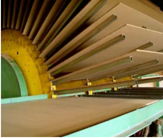
Figure 6. Medium density fibreboard produced from eucalypts at a factory in Zhanjiang, Guangdong [C. Cossalter]

the mean cost in the rest of the world, and this raises questions about the economic competitiveness of wood-based pulp production in this region (Cossalter 2005).