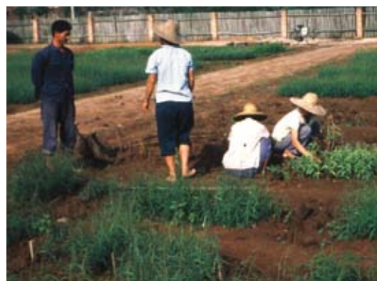
Figure 3. Raising Eucalyptus exserta in the nursery at Leizhou Forestry Bureau in 1980 [J. Turnbull]

Very-low-cost nursery techniques were developed locally (Figure 3). Eucalypt planting stock was raised in soil bricks rather than plastic or peat containers. The blocks were made in sunken beds where fertile loam was mixed with calcium magnesium phosphate and animal