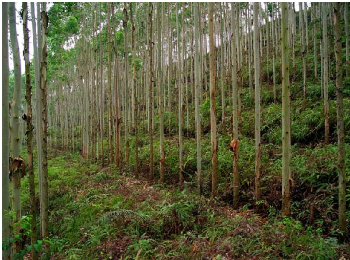
Figure 9. Clonal planting of a hybrid eucalypt for pulpwood production at Pu Bei county, Qinzhou prefecture, Guangxi. Planting distance 4 m × 1.25 m. Expected mean annual increment at end of rotation (6 years) is 26 m 3 /ha/year. [C. Cossalter]

around 7–10 clones of combinations of E. grandis and E. urophylla , and a total of only about 20 clones may have been used in commercial plantations in the whole country (Wang Huoran, Research Institute of Forestry, pers. comm. 2006). Barr and Cossalter (2004) claim that only three clones, i.e. U6 ( E. urophylla × E. tereticornis ), W5 ( E. '12 ABL' ) and E. 'leizhou No. 1' are used in about 90% of the plantations in western Guangdong. There is concern that the rapid expansion of plantations over several provinces has not been supported by the deployment of new clones tested for superior growth and resistance to pests and diseases. The lack of genetic diversity and the failure to deploy new clones are regarded as significant risks to the sustainability of the plantations. A factor contributing to this situation may be that nursery managers often resist the introduction of new clones whose nursery performance is less well known because of their potential effect on total production costs (MacRae 2003).