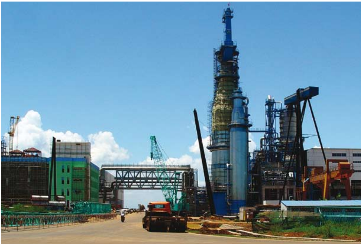
Figure 7. Asia Pulp and Paper pulp mill on Hainan Island [C. Cossalter]

In Guangxi, Japanese companies Oji Paper Co. Ltd and Marubeni Corporation have a joint tree-planting project and have established a 100% foreign-owned joint-venture company, Guangxi Oji Plantation Forest Co. Ltd. Marubeni is supporting Oji Paper in the current project based on experience gained in developing and importing eucalypt chips from China since 1987. Eucalypt planting started in 2002 with a target area of 6,000 ha (JOPP 2005) and harvesting will commence in 2008. Oji Paper and Marubeni have a second joint venture with the Chinese company Guangdong Petro-Trade Development to set up eucalypt plantations. This