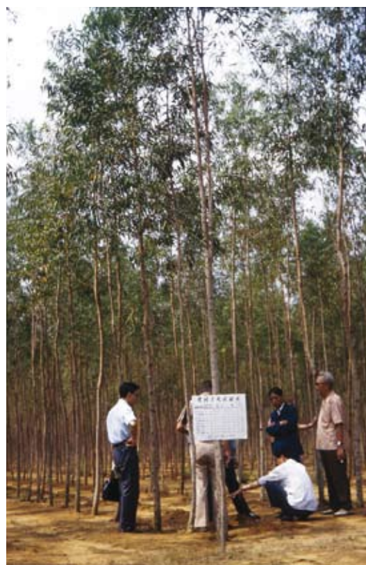
Figure 2. Eucalypt species trial planted 1974 at Leizhou Forestry Bureau, Guangdong