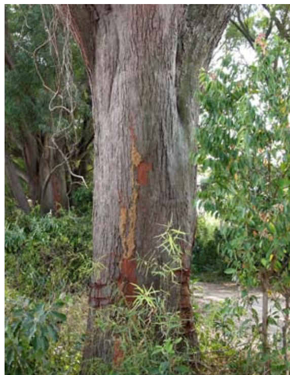
Figure 1. (a) Eucalyptus globulus in the grounds of the Golden Temple, Kunming, Yunnan [J. Turnbull]; (b) E. exserta planted an estimated 100 years ago near a village close to Zhuhai, Guangdong [Wang Huoran]