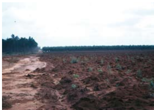
Figure 4. Intensive site cultivation in a new eucalypt plantation at Leizhou Forestry Bureau in 1980

Most plantations were grown on a 10–20-year rotation with two or three thinnings. Final stocking was 1,500 trees/ha for E. exserta and 900 trees/ha for C. citriodora . Much of the wood was grown with the objective of producing stems 14–16 cm diameter for use as pit props. It was also used for round construction and roofing timber and small turnery items. At Leizhou, branches