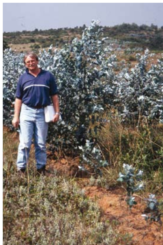
Figure 10. Poor growth of Eucalyptus globulus due to nutrient deficiency in plantations at An Lin Forest Bureau, Yunnan. Trees in the foreground are unfertilised, while those in the background have received phosphorus and boron fertiliser. [J. Turnbull]