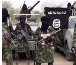
Shekau, Boko Haram Commanders reaching out to mediators for a ceasefire