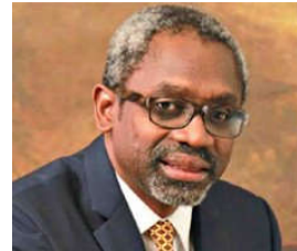
COVID -19: 'Gbajabiamila got our consent through State caucuses before announcing salary...