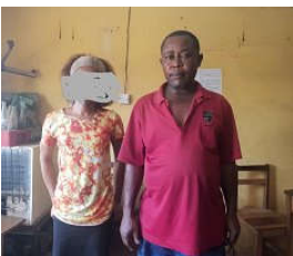
44-year-old man defiles his 14-year-old daughter in Imo