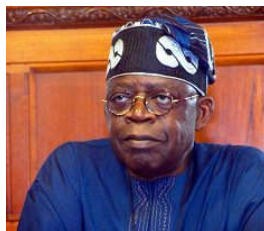
COVID-19: Tinubu urges FG to pay relief funds to Nigerians through BVN