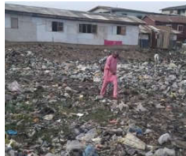
COVID-19: Carnal becomes dry land for commuters in Lagos State – Investigation