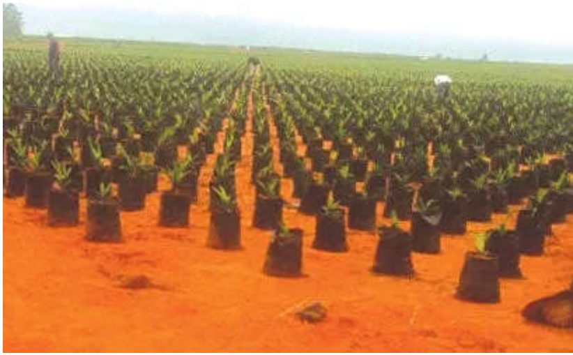
Section of Sakponba Estate oil palm nursery

Community leaders and representatives, who spoke to NDV , maintained that the fully integrated agro-industrial establishment with oil palm plantations, palm oil mill, palm kernel crushing plant and vegetable oil refining and fractional plant, has been a source of blessing to the people, and they would want the various communities, governments of Delta and Edo states to support the company that produces excellent quality products to customer satisfaction for greater benefits to the people.