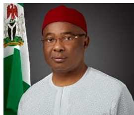
Thumbs up for Governor Uzodinma on COVID-19