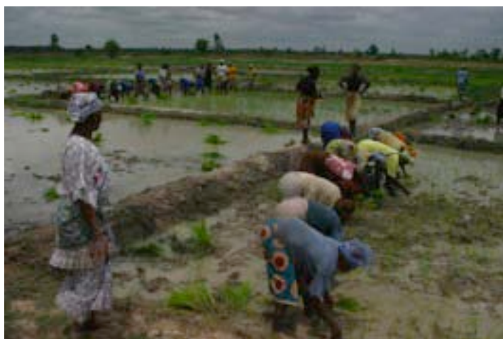
Rice farmers in the Senegal River Valley

These lands, most of which are farmed by families with access to less than a hectare, produce 70% of the national rice harvest and provide livelihoods for an estimated 600,000 people. But the area is also of vital importance for pastoralists and the production of other grains, such as sorghum, both of which tend to compete directly with the expansion of irrigation.