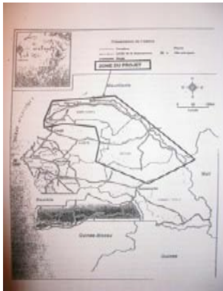
Cover page and map of the project location from the proposal developed for a project between Saudi and Senegalese investors to take over 120,000 ha of lands in the Senegal River Valley to produce 1 million tonnes of rice, mainly for export to Saudi Arabia.

The Senegal River Valley is the main irrigated rice producing area of Senegal. Around 120,000 ha in the area are suitable for irrigated rice production and about half of these are currently being farmed under irrigation.