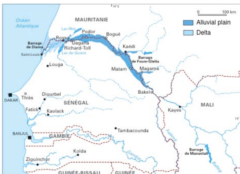
Map 2. Senegal River Valley

The "win-win" case for this project is hard to make, but the proposal tries to do so. It claims that the project will somehow contribute to Senegal's rice self-sufficiency and provide jobs for the peasants who will no longer be able to farm the lands. "The productive work force will be exclusively local in order to improve living conditions and provide, therefore, economic and social development options," says the proposal. As for the numerous pastoralists in the area who will lose access to both land and water for their herds, the company says that they will be able to buy feed from the feed mills that the project intends to build in the area. In this way, the company boasts, the animals will be fed "more easily and at a lower cost".