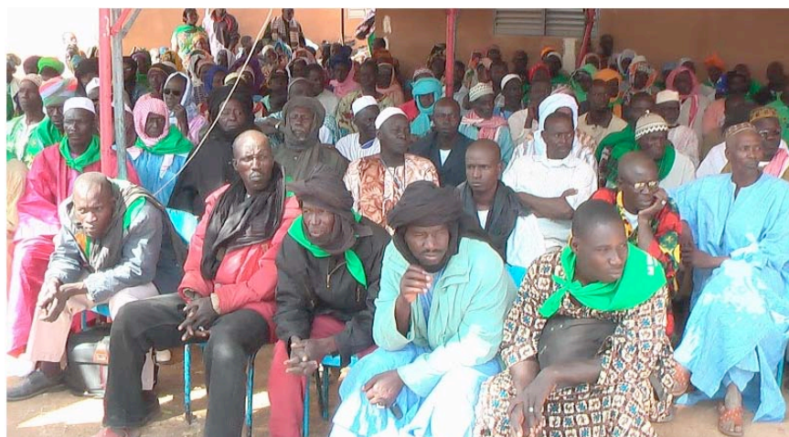
Farmers and pastoralists at the Kolongo Forum in Mali's Office du Niger call for all land deals with foreign investors to be suspended

What are we to make of this? One group of Saudi investors withdraws, while another pushes ahead, for the same objectives and under the same national plan of the Saudi Kingdom to outsource food production. The government of Senegal signs an agreement