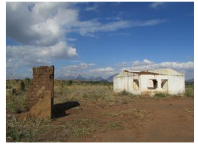
Abandoned house belonging to a family resettled by Mozaco.

(/media/BAhbBlshQgZmSSJVMjAxNS8wMi8xOC8wMI8yMF81NV81MzIfTW96YW1iaXF1ZV9hYmFuZG9uZWRfaG91c2Vfc mVzZXRObGVtZW50X21vemFjb19HUKFJTI5qcGcGQgZFVA). The area occupied by Mozaco in Natuto community, Administrative Post Canhunha, Malema District, is an area that in colonial times was occupied by a settler called Morgado, who produced tobacco and cotton on around 1,000 ha. After independence, the government nationalised the lands and installed a state company known as Unidade de Namele, which also operated farms in Ribaué and Laulaua Districts. At its height, the state farm employed 5,000 workers but, by 1989, with the civil war intensifying, it was shut down.