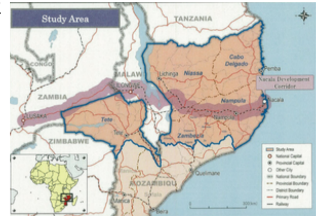
Image from PEDEC (Project for Economic Development Strategies for the Nacala Corridor), 2014

(/media/BAhbBlsHQgZmSSI1MjAxNS8wMi8xOC8wMI8wNV8zM181MTIfTmFjYWxhX3N0cmF0ZWd5X3BsYW4ucG5nBjoGRVQ) . The governments, companies and agencies promoting ProSavana and the other projects in the Nacala Corridor maintain that local farmers will benefit from in the new investment, infrastructure and access to markets. They also say that peasants will not be displaced from their lands to make way for corporate farms.