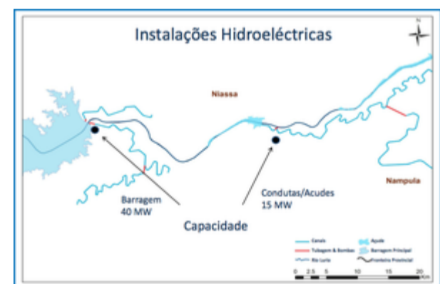
Click to enlarge: slide adapted from a presentation made by Companhia de Desenvolvimento do Vale do Rio Lúrio in January 2014.

( /media/BAhbBlSHOgZmSSlrMjAxNS8wMi8xOC8wMI8wMI8zN181MjdfTHVyaW9fZGFtcy5wbmcGOGZEVVA ). The Lúrio River project and ProSavana should not be seen separately. They are part of a broader push, involving the World Bank and the G8's New Alliance for Food Security and Nutrition, to open Mozambique up to large scale agribusiness projects.