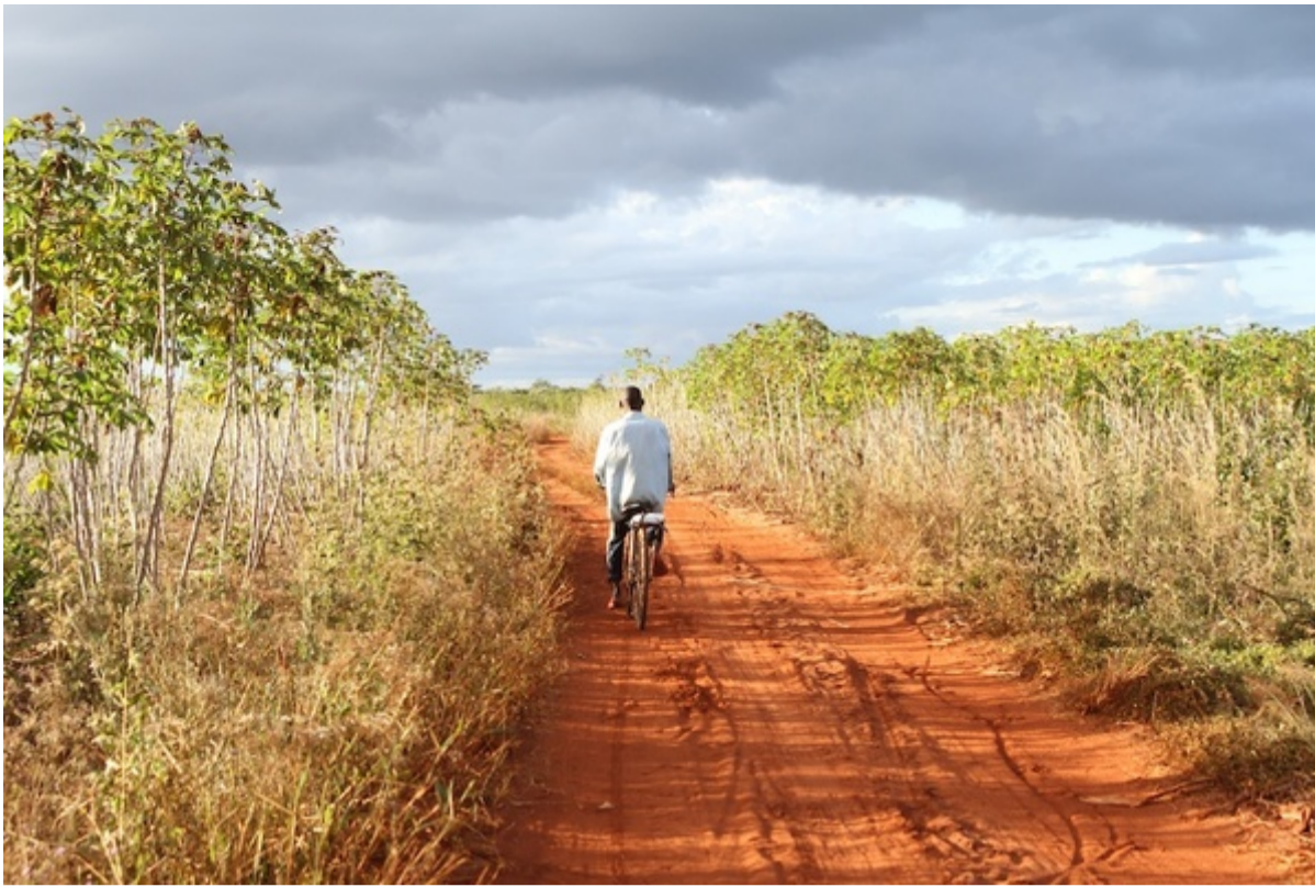
The rush for African farmland is

partly a result of the food price crisis of 2008, which made it difficult for countries dependent on food imports to source the foods they need at affordable prices. In response, some of the richer food importing countries, like the Gulf states, China and Japan, adopted new policies to encourage their corporations to acquire large farms overseas to produce foods for export back to their home countries. Africa is seen as one of the new frontiers where agricultural commodities can be produced cheaply and exported to supply the world's growing demand.