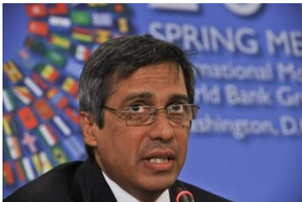
The Mauritian Minister of Finance, Charles Gaëtan Xavier Luc Duval

(/media/BAhbBlshQgZmSSlqMjAxNS8wMi8xOC8wMI8zM18zOV8xMF9tYXVyaXRpdXMuanBIZwY6BkVU). In 2009, the Government of Mauritius established the Regional Development Company Ltd (RDC) to carry out investments in Mozambique, particularly in food production.