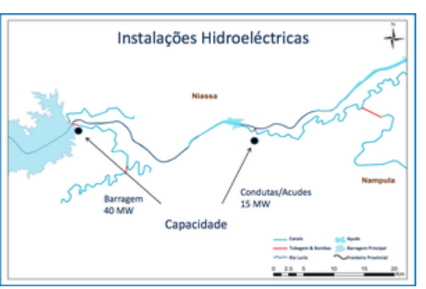
Click to enlarge: slide adapted from a presentation made by Companhia de Desenvolvimento do Vale do Rio Lurio in January 2014.

<u>(/media/BAhbBIsH0gZmSSIrMjAxNS8wMi8x0C8wMI8wM18zN181MjdfTHVyaW9fZGFtcy5wbmcG0gZFVA)</u> The Lúrio River project and ProSavana should not be seen separately. They are part of a broader push, involving the World Bank and the G8's New Alliance for Food Security and Nutrition, to open Mozambique up to large scale agribusiness projects.