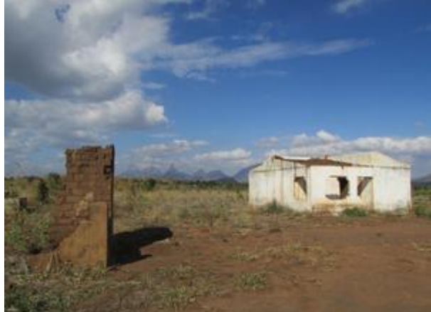
Abandoned house belonging to a family resettled by Mozaco.

(/media/BAhbBIsHOgZmSSJVMjAxNS8wMi8xOC8wMI8yMF81NV81MzIfTW96YW1iaXF1ZV9hYmFuZG9uZWRfaG91c2Vfc mVzZXR0bGVtZW50X21vemFjb19HUkFJTi5qcGcG0gZFVA) Community, Administrative Post Canhunha, Malema District, is an area that in colonial times was occupied by a settler called Morgado, who produced tobacco and cotton on around 1,000 ha. After independence, the government nationalised the lands and installed a state company known as Unidade de Namele, which also operated farms in Ribaué and Laulaua Districts. At its height, the state farm employed 5,000 workers but, by 1989, with the civil war intensifying, it was shut down.