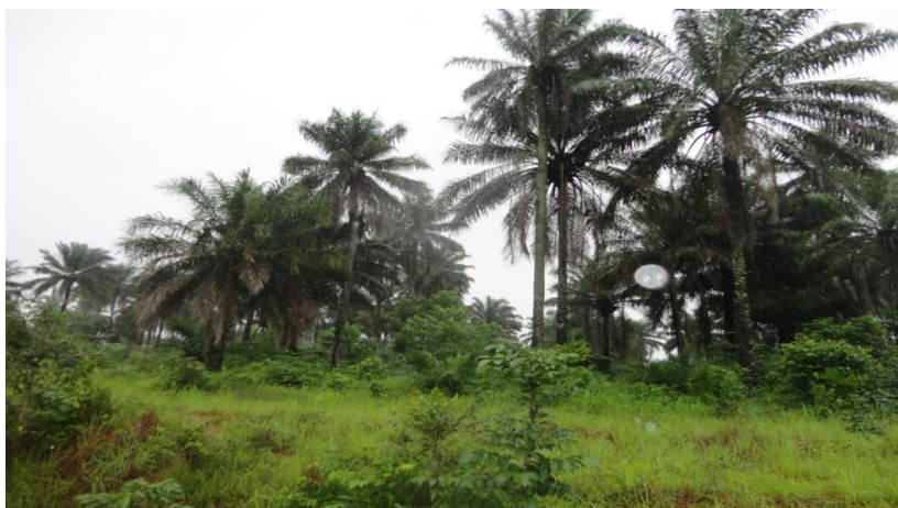
Elaeis guineensis , commonly called oil palm or African oil palm in English; Mchikichi (Swahili) or Odé or dé (Fongbé, Goungbé, Tolligbé).

There is a part of the world where palm oil is not synonymous with deforestation and plantations, where it is not an export commodity but an essential ingredient in local dishes, and where its production profits peasants not bankers. In Africa, the centre of origin for oil palm, tens of millions of people, most of them women, rely on this tree for food and livelihoods.