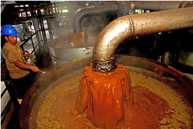
Processing palm oil fruits at a factory in Medan, Indonesia.

Fifty years ago you would be hard pressed to find foods made with palm oil unless you were in Central or Western Africa where the crop originates from. Today it's hard to avoid it. Palm oil is everywhere, especially in processed foods. Studies suggest it is contained in about half of the packaged foods on supermarket shelves, whether you are