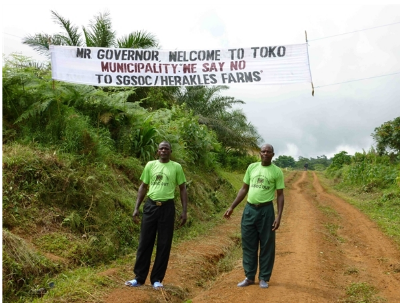
Resistance to a landgrab for a new oil palm plantation in Cameroon.

The communities facing land grabs from palm oil companies are under tremendous pressure to accommodate them, with pressure coming from the companies, the government, the local chiefs and even the army and paramilitaries. Those who resist face arrest, harassment and violence. And yet communities in Africa and around the world, from Papua New