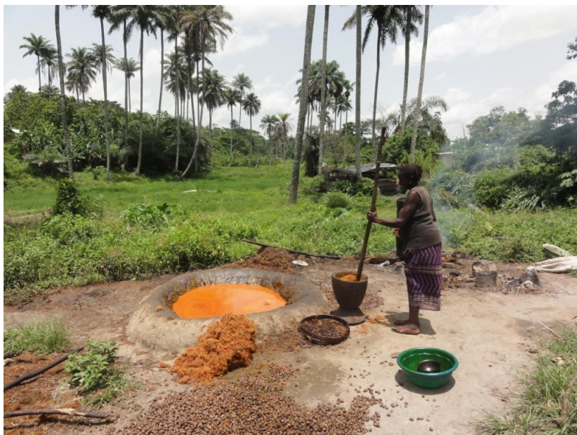
Artisanal palm oil production in Guinea.