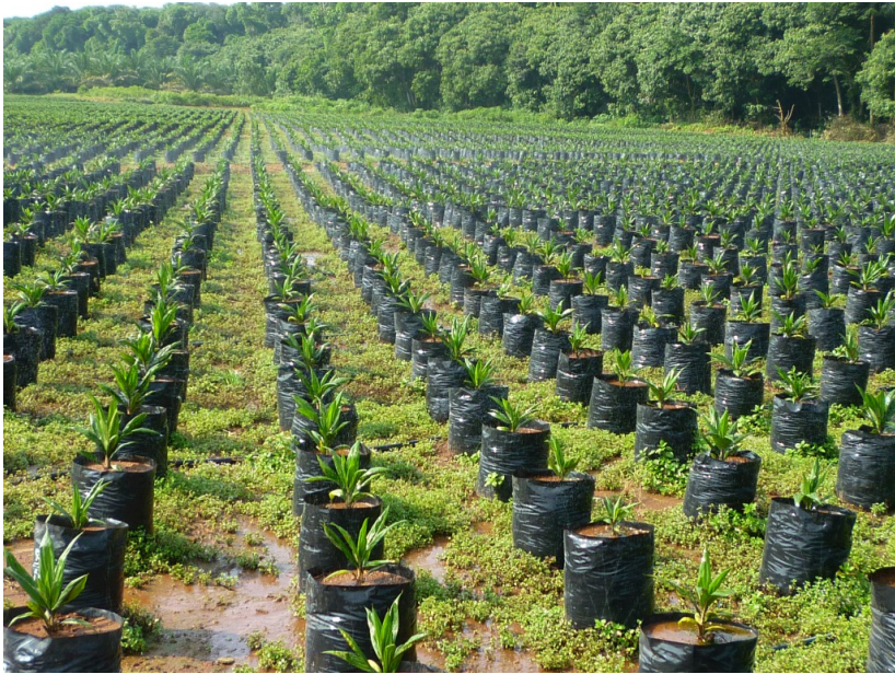
Oil palm seedlings in Malaysia.

With all this money pouring into palm oil companies, lands for oil palm plantations are at an all time premium, wherever they can be found.