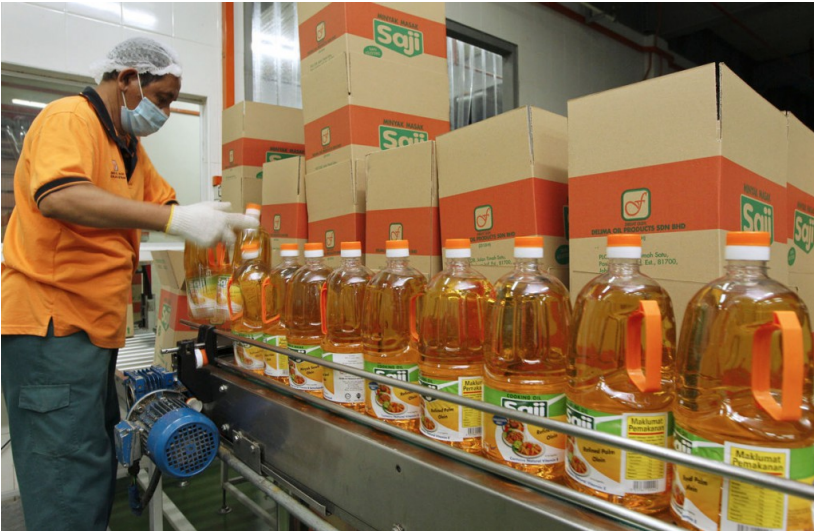
The Malaysian state-owned company Felda raised $2 billion from a stock offering which it has been using to buy up lands for oil palm and rubber plantations.

The surging global demand for oil palm has produced windfall profits for palm oil companies and turned them into hot targets for investment by banks, pension funds and other financiers looking to cash in on the palm oil boom. All the major palm oil companies are ploughing this new found money into more plantations. So much so that it is difficult to say if money is a bigger driver of plantation expansion than the global demand for palm oil.