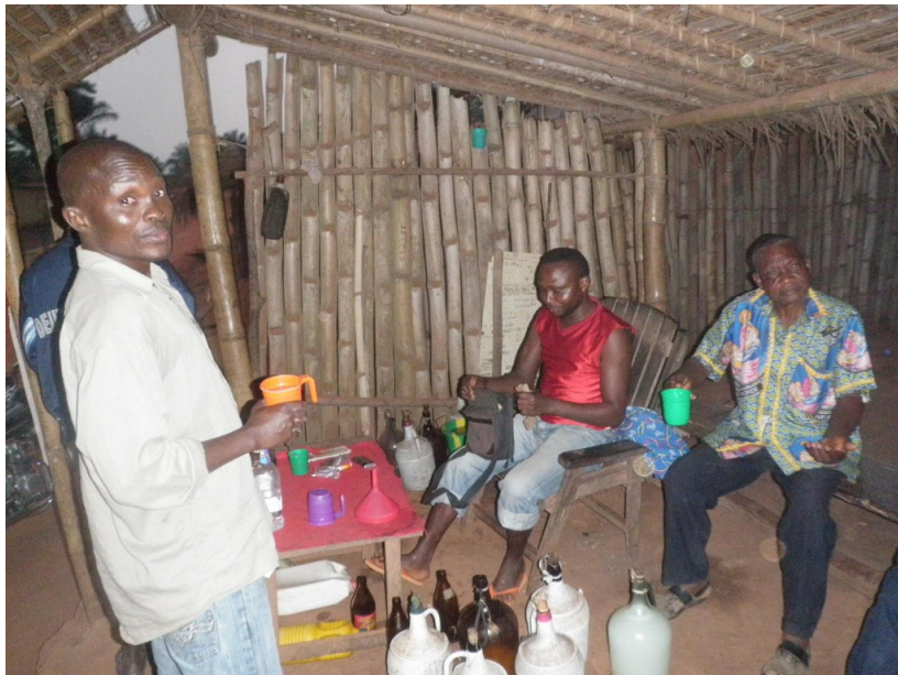
Villagers relaxing with a few bottles of palm wine at the end of the day in the fields.

In the Congo, wine made from oil palms has various uses.