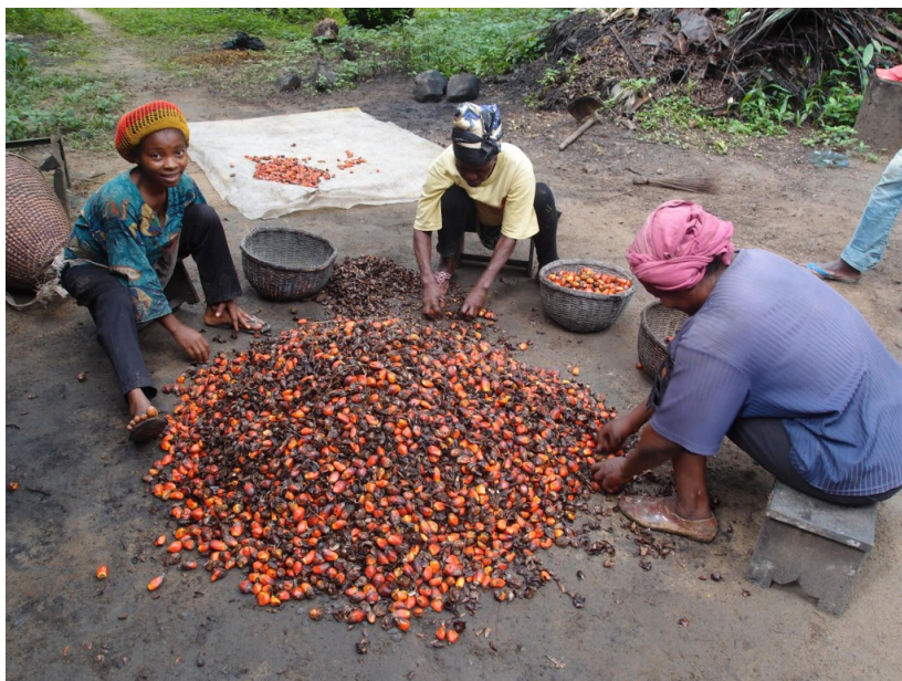
Cameroonian women sorting palm fruits.

Palm oil is ubiquitous in our food systems. Look at the ingredients on any packaged food, and chances are you will find it there. Food companies love it, because it's cheap and abundant, so they use it whenever they can.