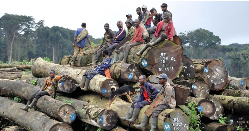
Villagers at the site of a new industrial oil palm plantation in Cameroon.

Local communities can only lose from this new wave of land grabs for palm oil. They lose access to vital lands and water resources, now and for future generations. And they have to face all of the impacts that come with vast monoculture plantations within their territories– pollution from pesticides, soil erosion, deforestation, and labour migration. Experience also shows that the employment generated by the plantations often goes to outsiders, and that most of the jobs are seasonal, poorly paid, and dangerous. Certification schemes, such as the Roundtable on Sustainable Palm Oil (RSPO), can only alleviate or postpone some of the worst excesses (See below: Why the RSPO facilitates land grabs for palm oil ).