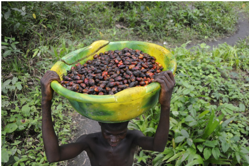
Harvesting palm fruits on a plantation in Liberia.

Liberian timber in 2006, they made the startling discovery that the Malaysian logging company Samling had taken control of around 10% of Liberia's total land area. Samling linked companies had acquired permits covering 10,200 km 2 . 4