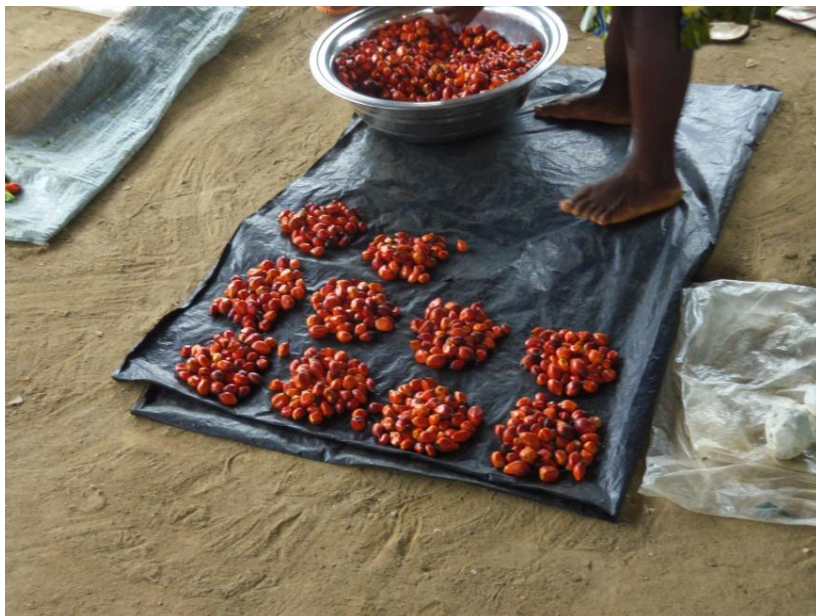
Oil palm kernels on sale in Côte d'Ivoire.

The study found that Abidjan's discerning consumers prefer palm oil derived from wild or semi-wild oil palms (so-called "African" oil) over palm oil derived from modern high-yielding varieties (referred to as "sodepalm" for the former agroindustrial oil palm corporation). They also differentiate among the territories where palm oil is produced, such as Bouaké, Gagnoa, Bouaflé, Adjukru, or Attiés, with preference given to those regions where modern varieties are not cultivated.