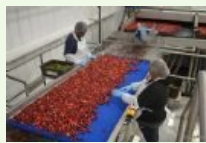
Sutherland Cherry Packing House