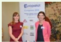
Europatat Congress 2018