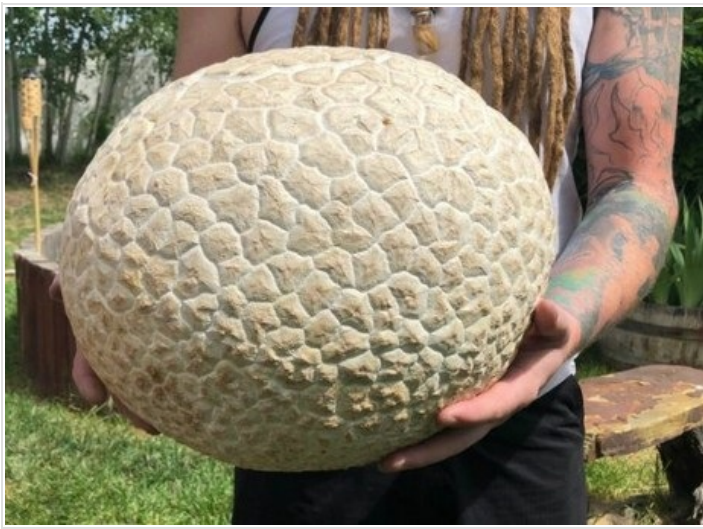
Post Falls, Idaho