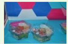
CPMA 2018 New Product Showcase