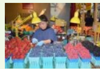
CPMA 2018 Retail Tour