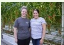
Village Farms visit