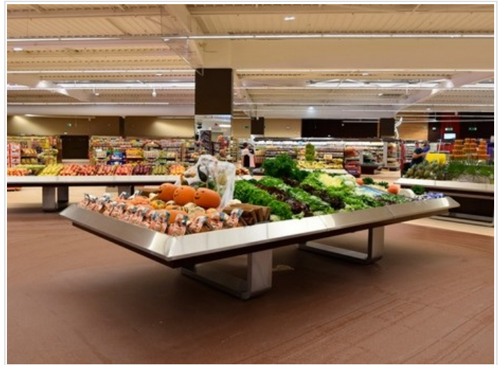
HMV's new Fleg 7 display