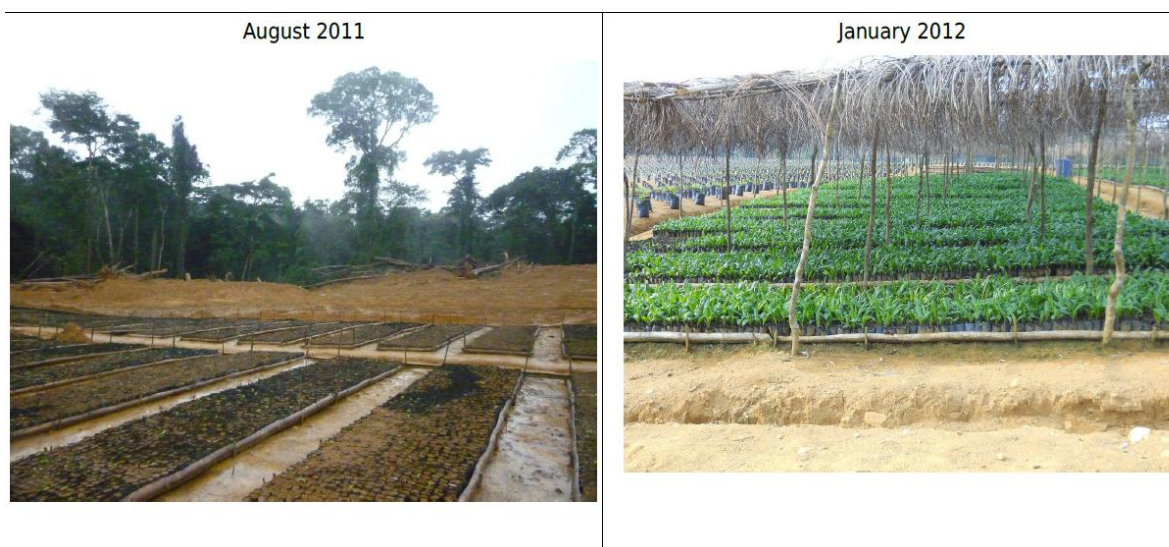
Photos of SGSOC's Palm Nurseries.

The extremely favorable terms of SGSOC's contract will permit the company to pay little or no taxes on a very profitable project.