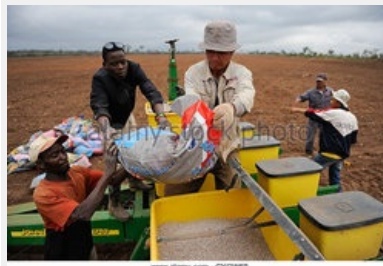
Citic's farm in Malanje