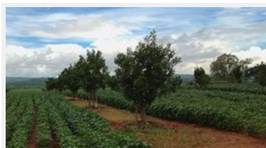
The Jacoma Estates farm in Malawi.

LONDON - AgDevCo, a social impact agribusiness investor, today announced a USD 2.0 million debt investment into a Malawian macadamia farm, as part of a USD 6.0 million financing round.