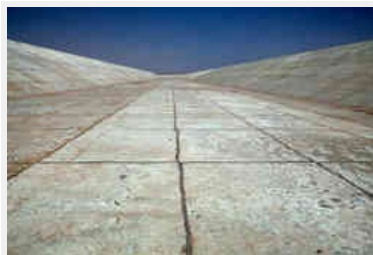
An empty water canal at Sheikh Zayed, near Toshka

* Egyptian government keen on attracting foreign investment in agriculture