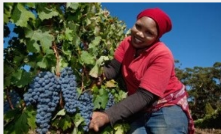
The agreement with Libya would mainly be to grow grapes and olives