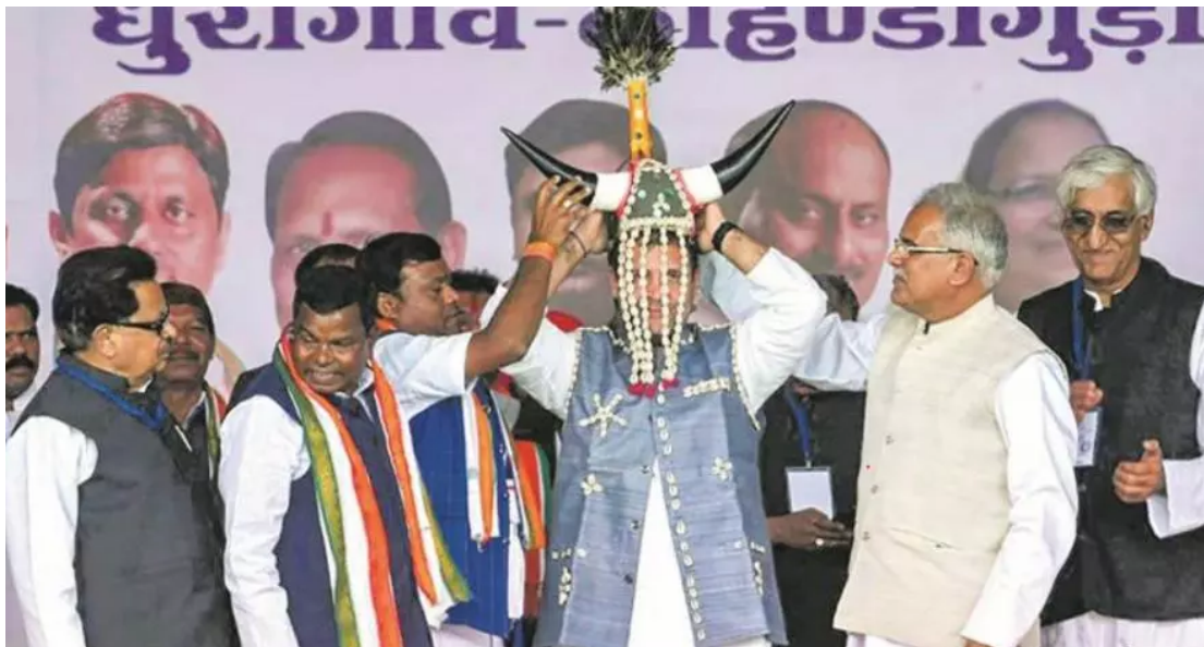
Image for representational use only.

Saurabh Sharma (/author/Saurabh Sharma) 18 Feb 2019