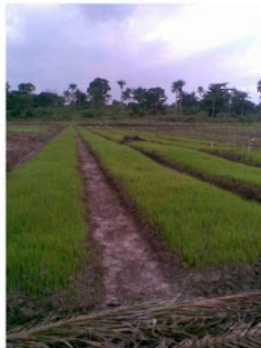
Picture of the rice farm in Akwa Ibom While it was operational