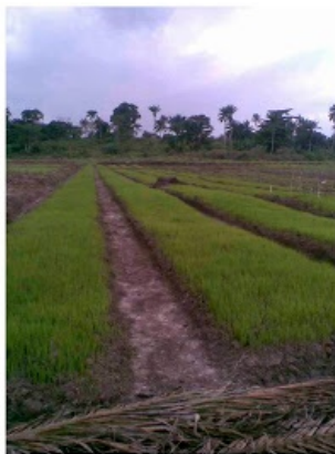
Picture of the rice farm in Akwa Ibom While it was operational