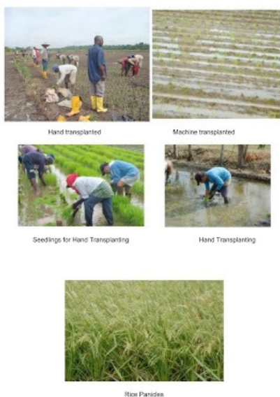
Rice Project pictures above show the activities in the rice farm when it was in force

...AS DREAM OF 4000 JOBS FOR AKS PEOPLE REMAINS A MIRAGE