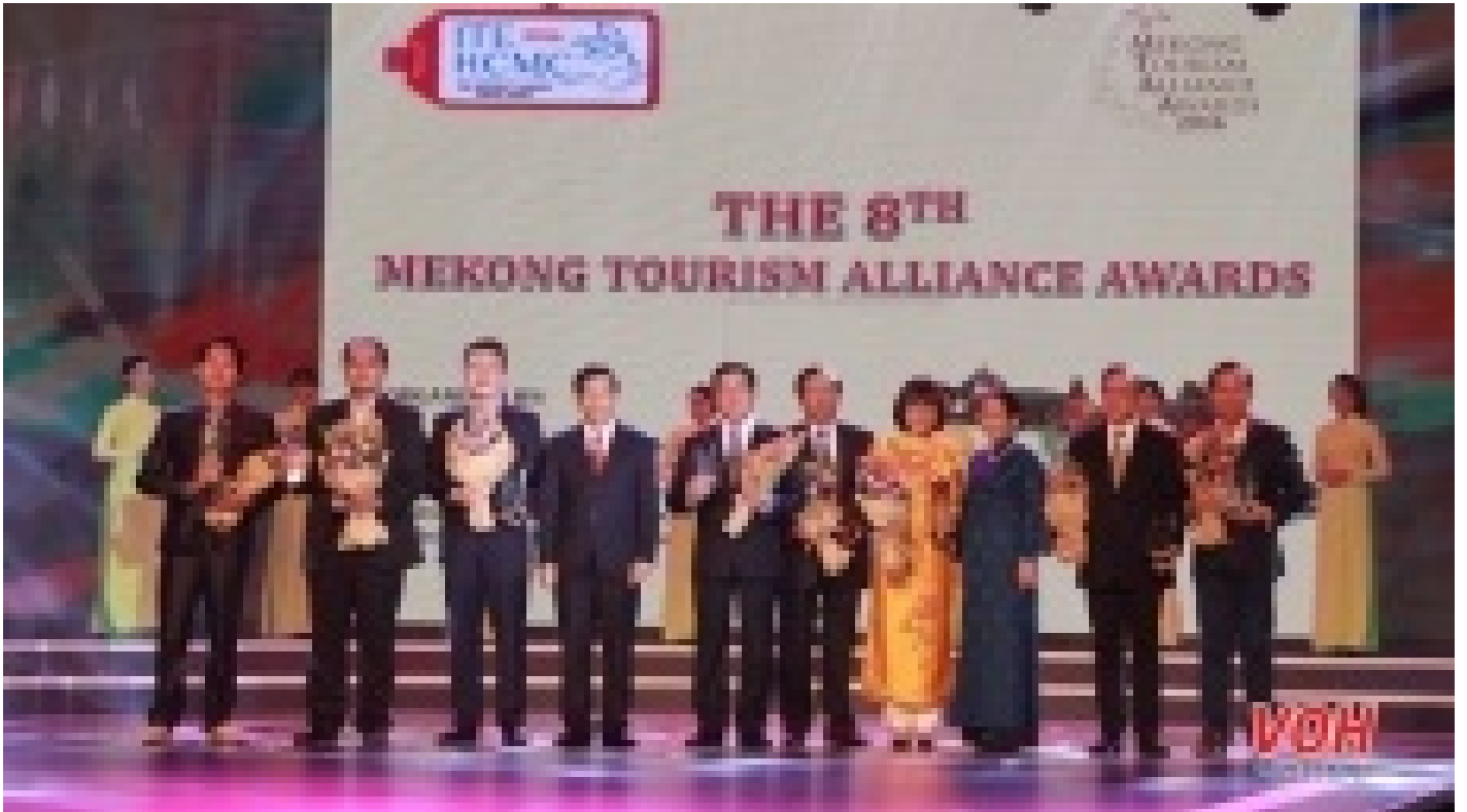
International Travel Expo opens in HCM City (Travel, 2 hours ago)