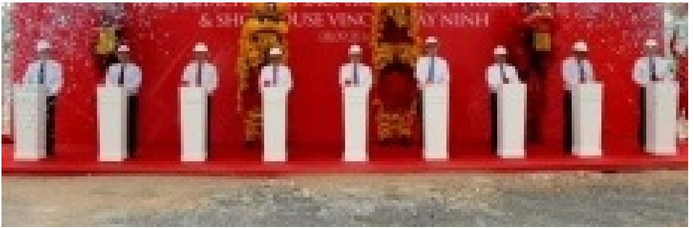
Works starts on 5-star hotel and trade centre complex in Tay Ninh (Business: Economy, 2 hours ago)