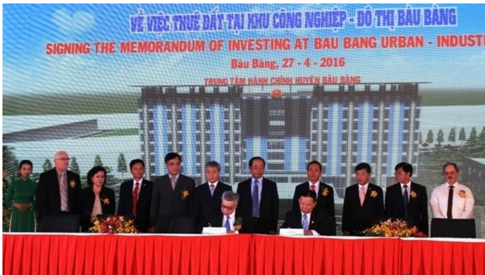
The signing of the MoU on the establishment of a Vietnam-US industrial zone