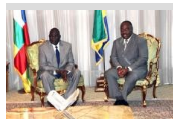
Caretaker President of the Central African Republic (CAR), Michel Djotodia, met with President Ali Bongo Ondimba