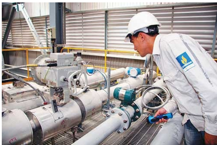
PetroVietnam is looking to buy out Itochu and Licogi 16 but admitted sourcing capital for the deal was a problem.

VietNamNet Bridge - PV Oil - the wholly owned subsidiary of the state-run PetroVietnam - recently said it was considering negotiating with Itochu and Licogi 16 to buy out a 71 per cent stake in the joint venture to build an $80 million ethanol factory in the southern province of Binh Phuoc.