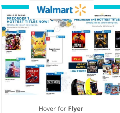
Hover for Flyer