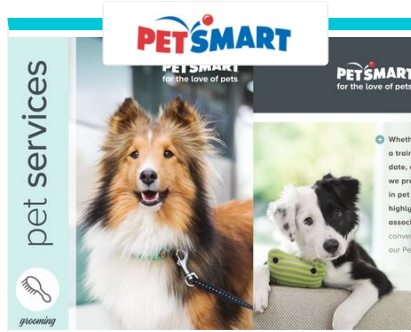
Hover for Flyer