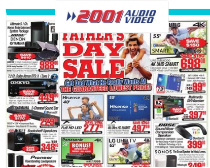
Hover for Flyer