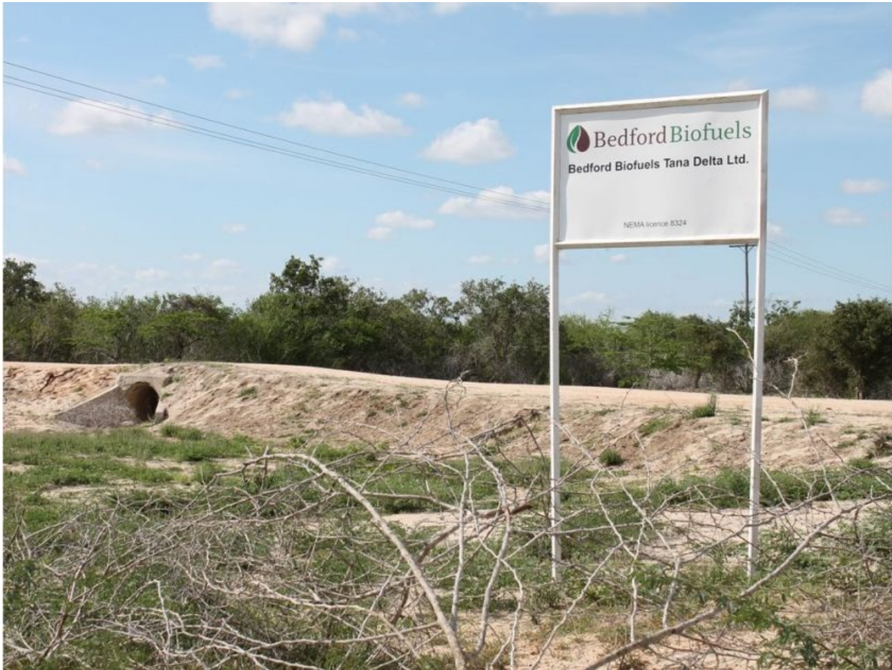
A 2012 photo of the entrance to Bedford Biofuel's pilot project in Kenya's Tana Delta.

An Edmonton businessman who raised more than $16 million from investors for a failed Kenya oilseed project has been charged with breaching securities legislation by the Alberta Securities Commission.